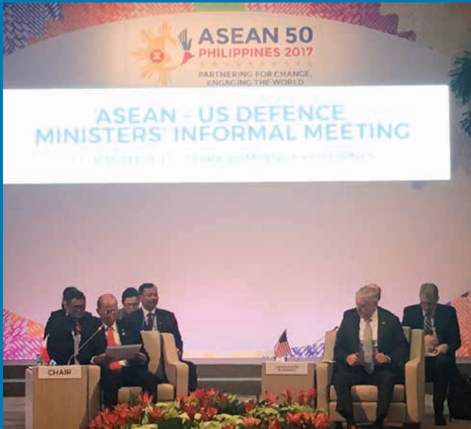
ASEAN-US Defence Ministers' Informal Meeting, 23 October 2017, ASEAN Convention Center