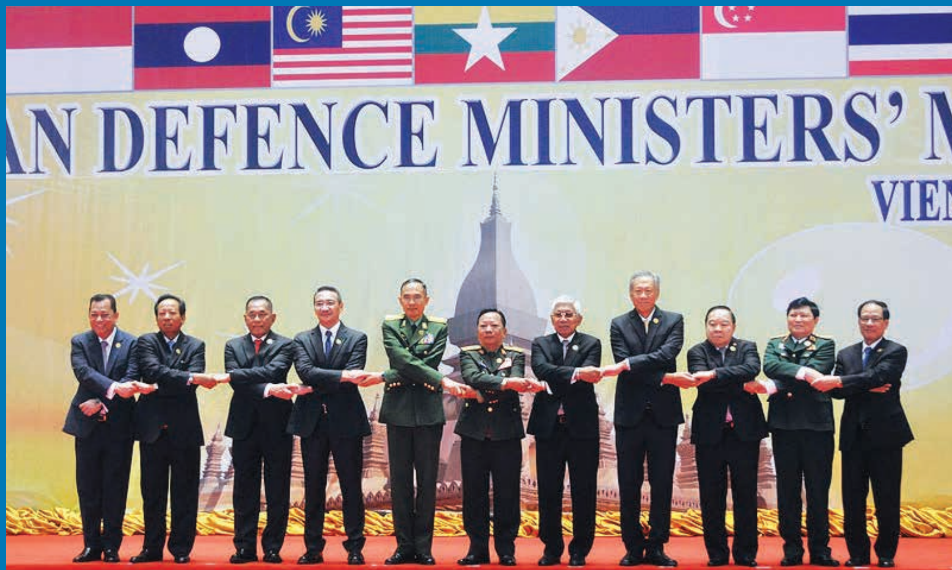
10 th ADMM Group Photo at National Convention Centre on 25 May 2016