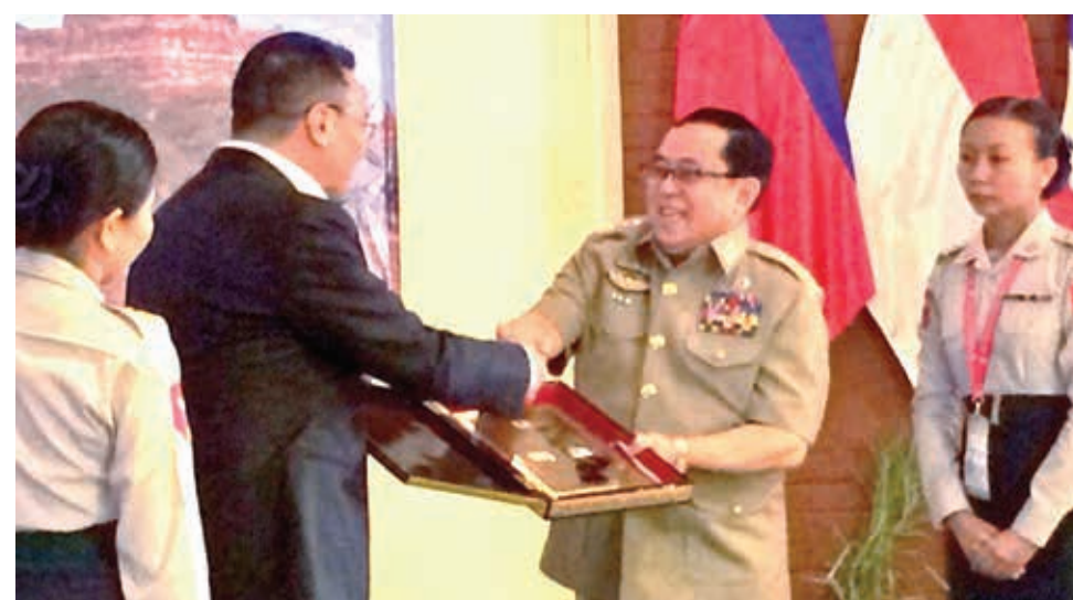
His Excellency Lieutenant General Wai Lwin, Union Minister for Defence of the Republic of the Union of Myanmar and The Honourable Dato' Seri Hishammuddin Hussein, Minister of Defence Malaysia at the Handover Ceremony.