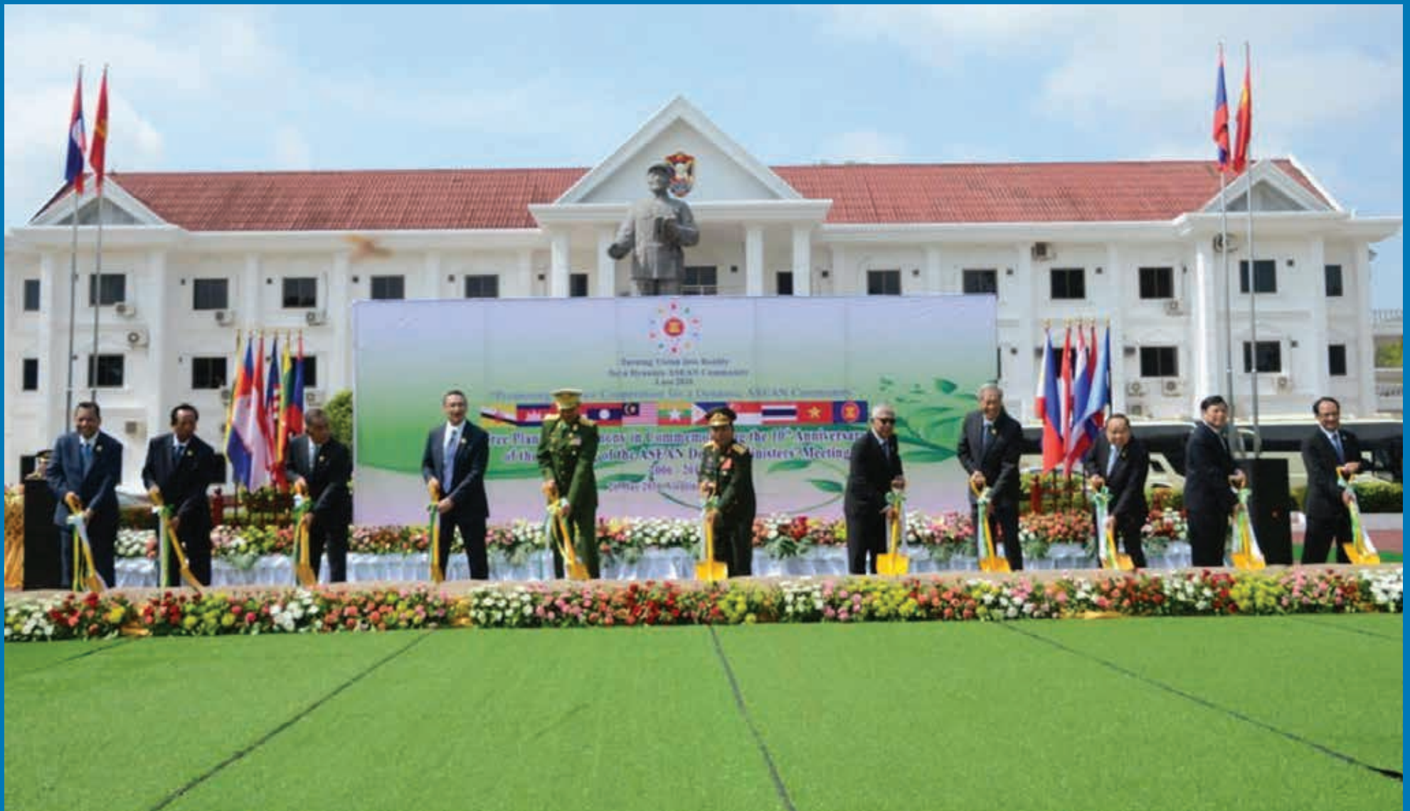
ASEAN Defence Ministers, representative and ASEAN Secretary General planted ADMM trees at Kaysone Phomvihanh Academy of National Defence on 26 May 2016