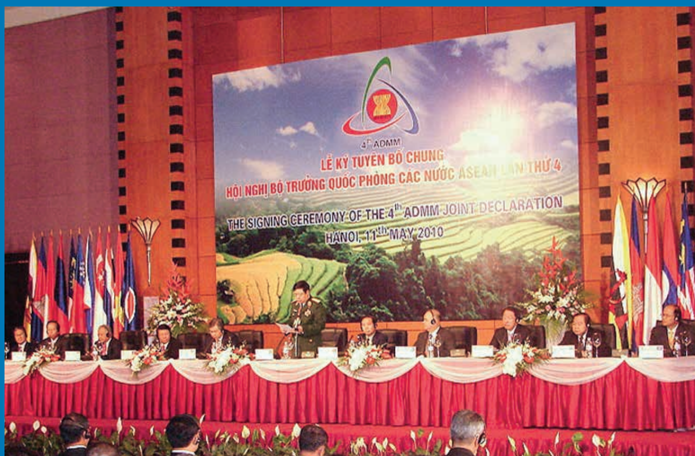
Signing Ceremony of the 4th ADMM Joint Declaration