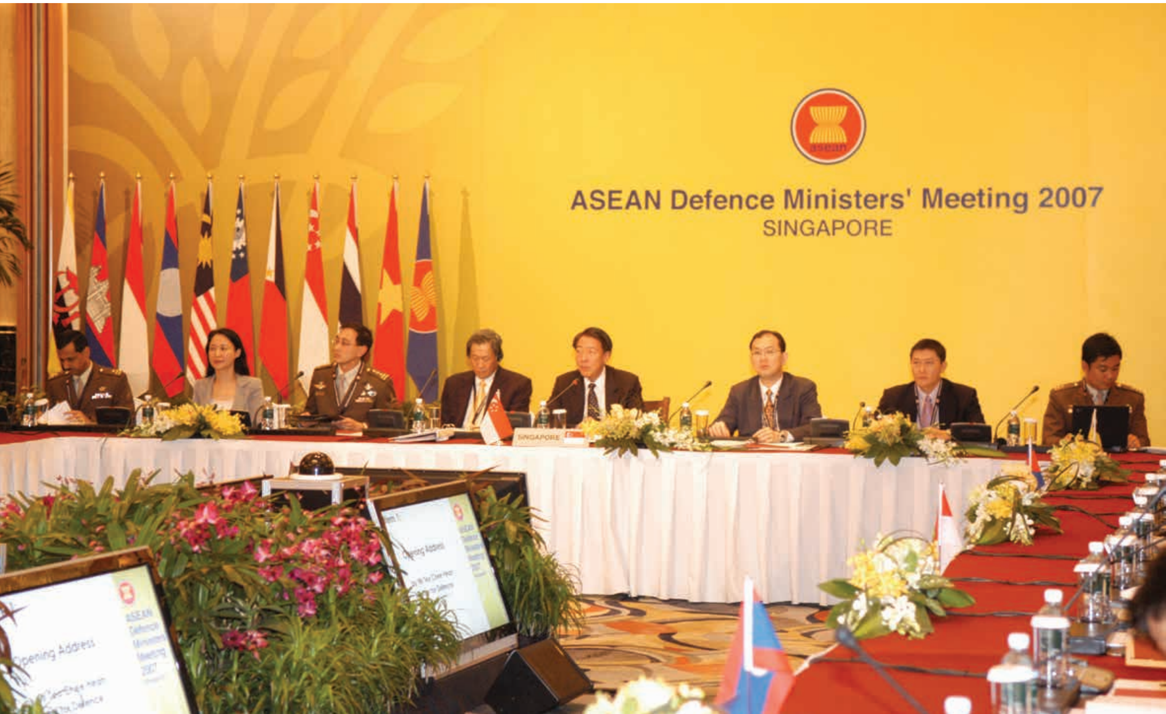
His Excellency Teo Chee Hean, Minister for Defence Singapore, delivering his opening address at the 2nd ADMM in November 2007.