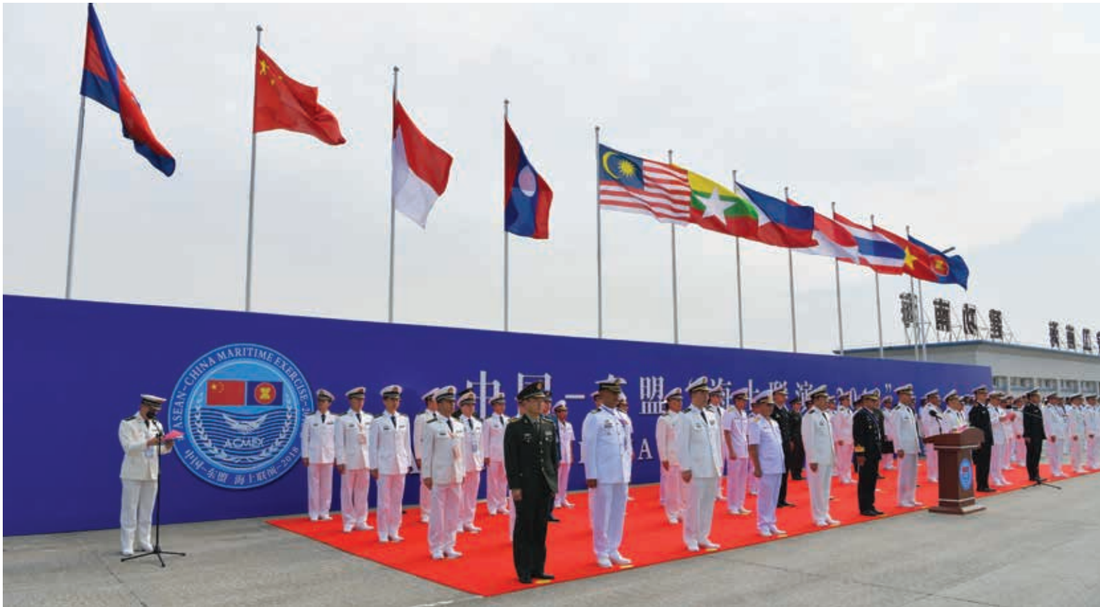
Representatives from the ASEAN and China navies during the closing ceremony of the ASEAN-China Maritime Exercise in Zhanjiang, China, in October 2018.