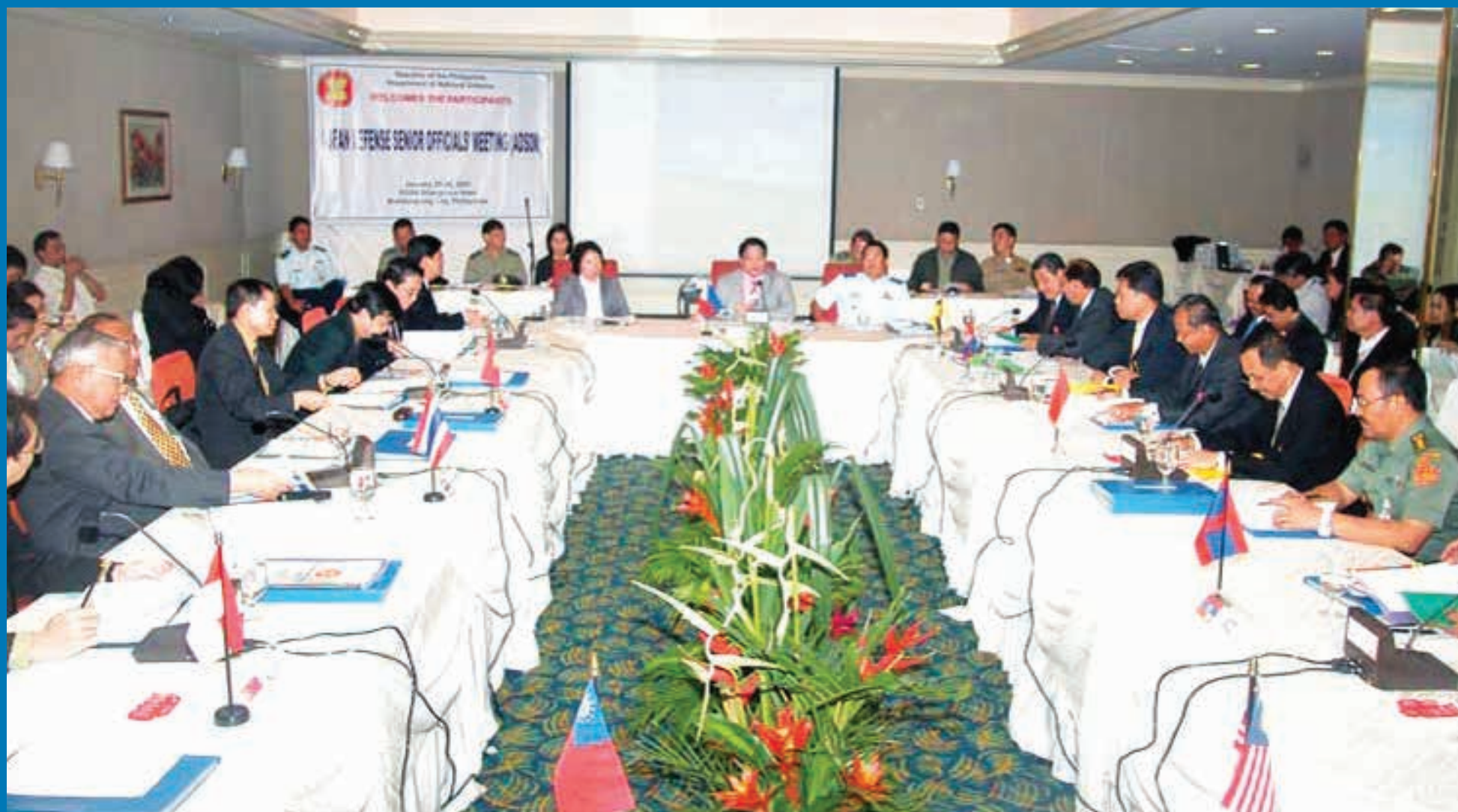
ADSOM, 25-26 January 2007