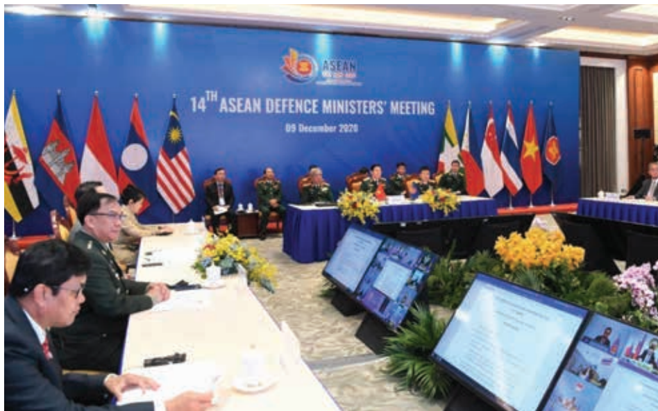
The 14th ADMM was held virtually on 09 December 2020.