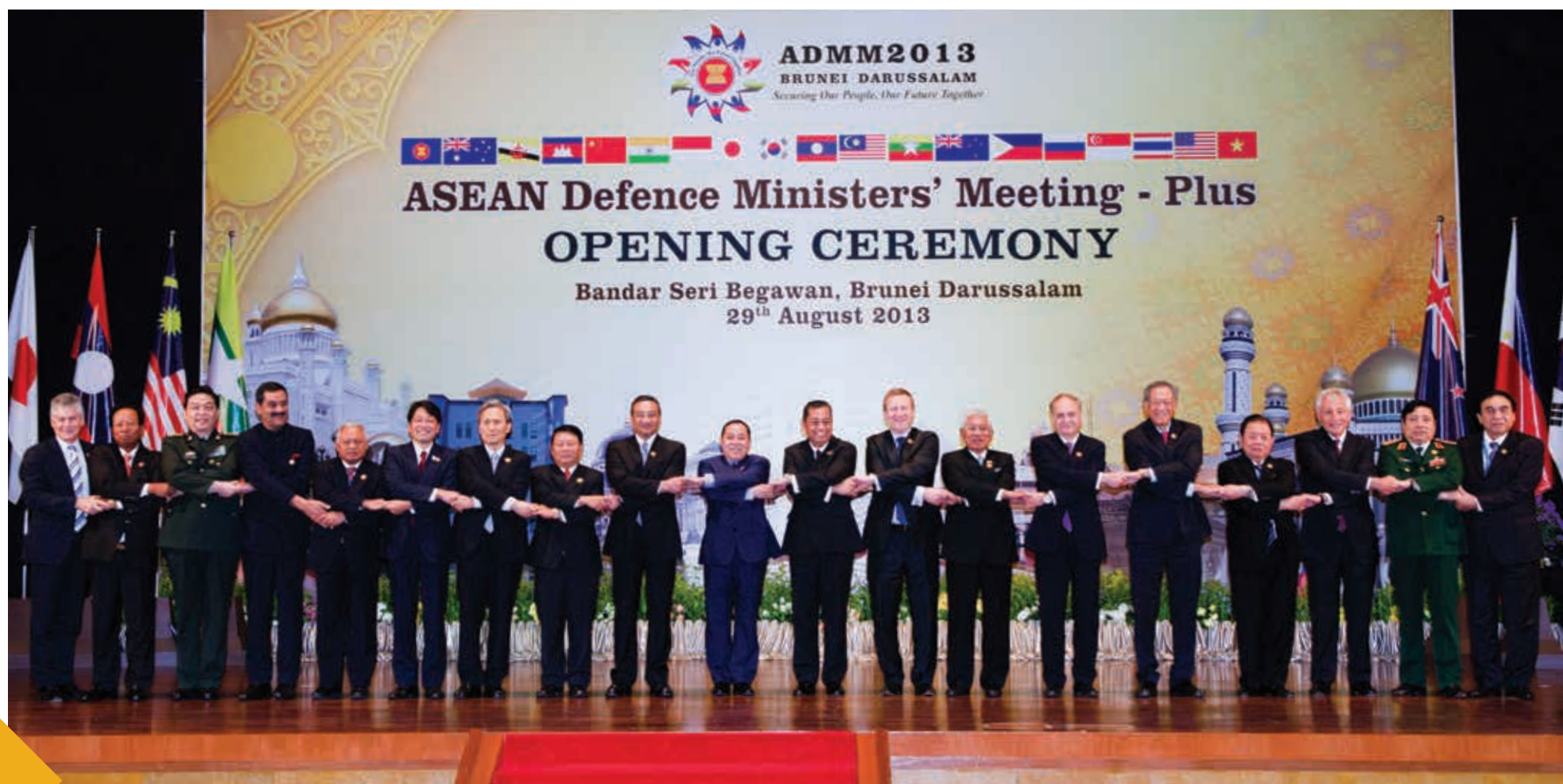
Group Photo of the ADMM-Plus