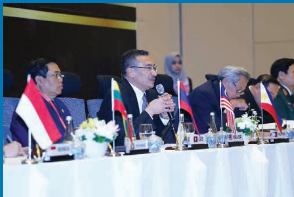
The Honourable Dato' Seri Hishammuddin bin Tun Hussein, Minister of Defence Malaysia, during the Press Conference after signing the Joint Declaration of the 9th ADMM.