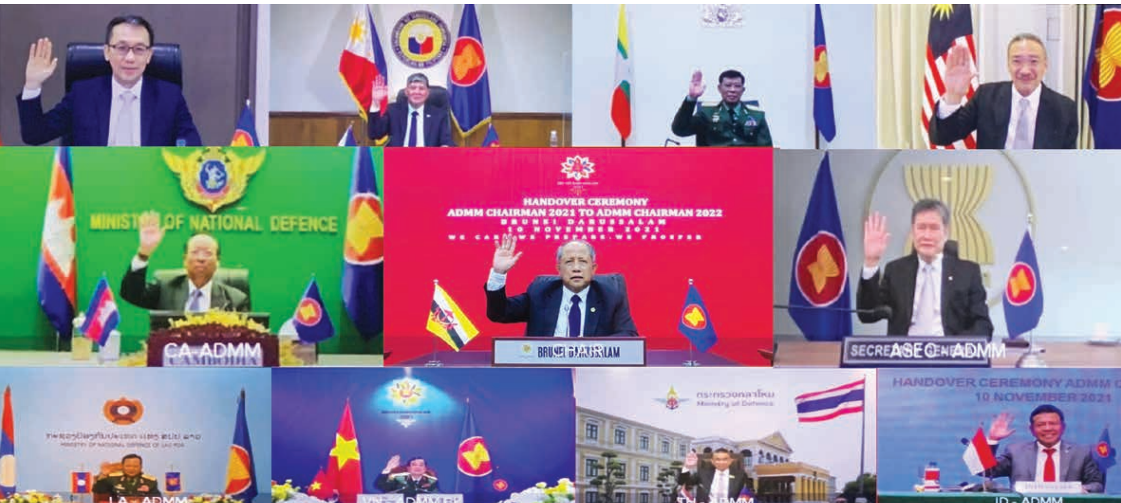
ASEAN Defence Ministers and representatives pose for a final group photograph during the Handover Ceremony of the ADMM Chairmanship 2022 to the Kingdom of Cambodia