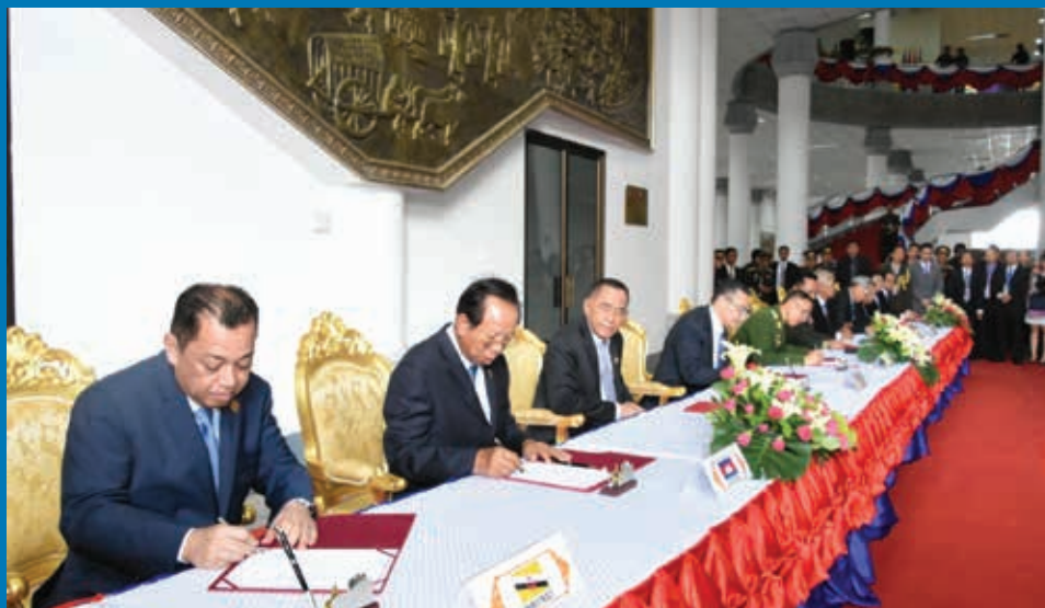
Commemoration Ceremony of ADMM at Lao People's Army Museum on 26 May 2016.