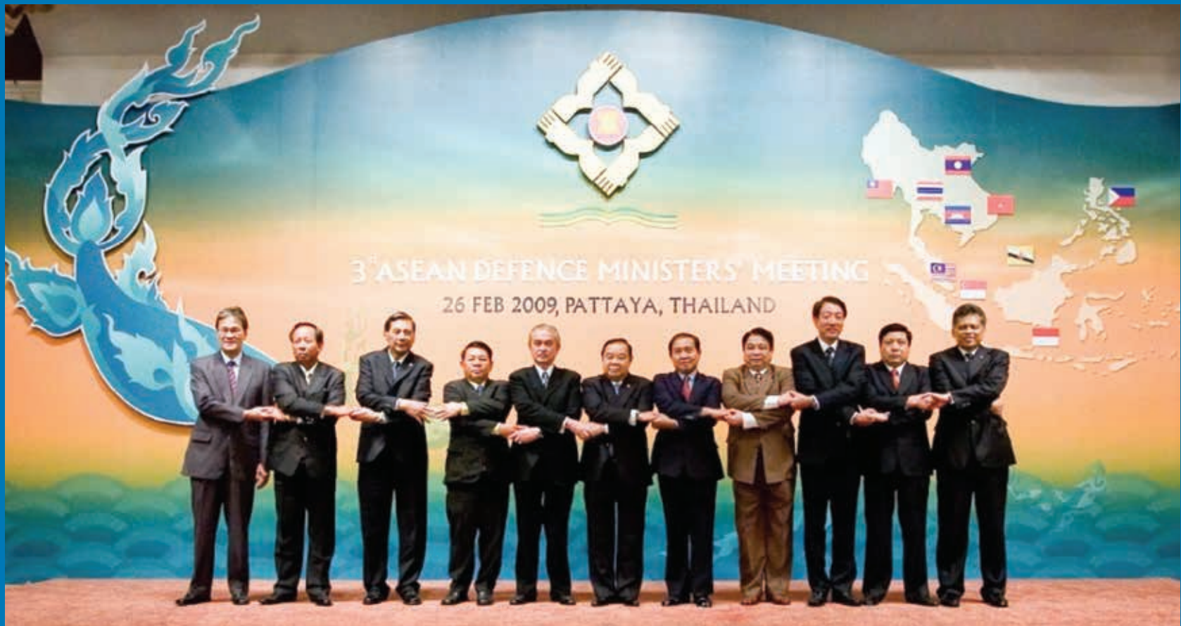
3rd ADMM, Pattaya, Thailand, 26 February 2009