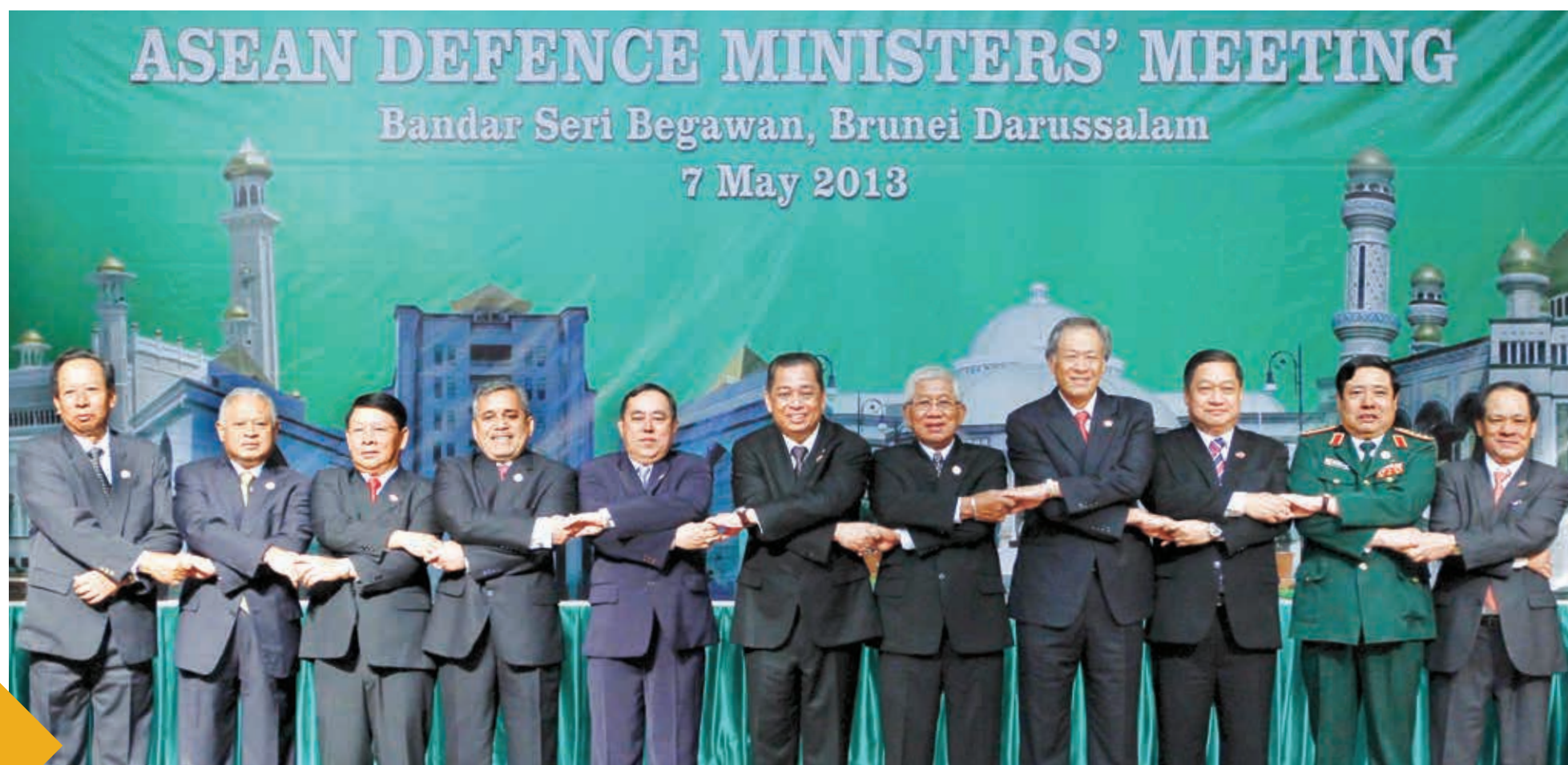
ASEAN Way Group Photo of the 7th ADMM