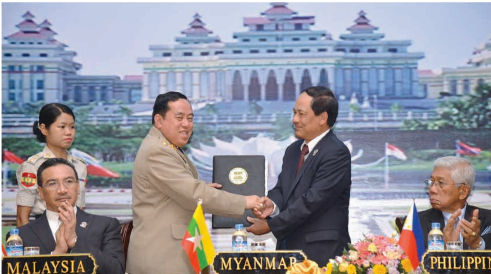
Handover of the 8 th ADMM Joint Declaration to ASEAN Secretariat