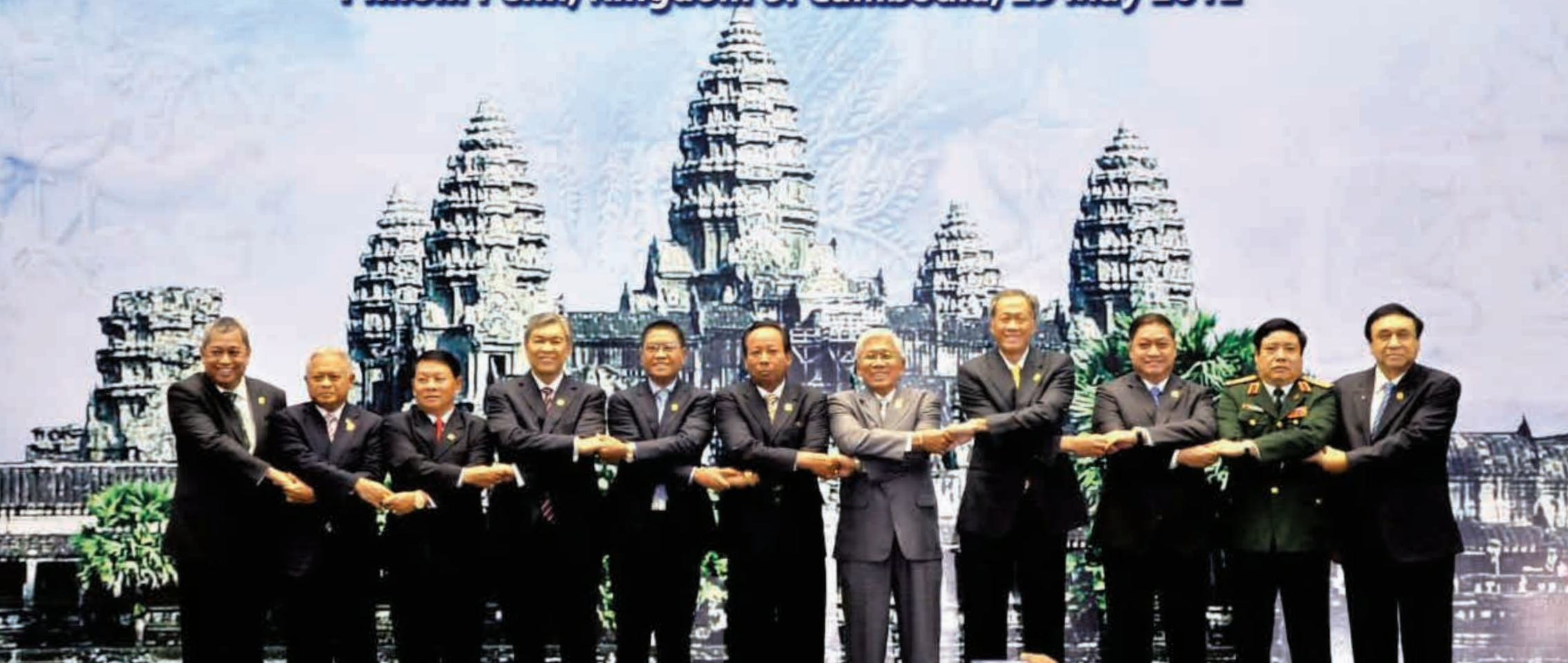
The 6th ASEAN Defence Ministers' Meeting (6th ADMM) on 29 May 2012, Phnom Penh, Cambodia

Phnom Penh, Kingdom of Cambodia, 29 May 2012