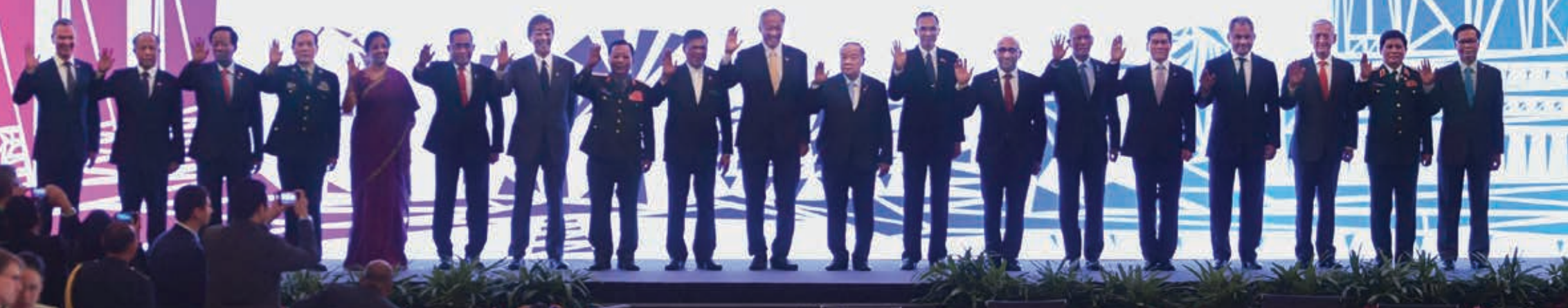
A Group Photo of the 5th ADMM-Plus held on 20 October 2018