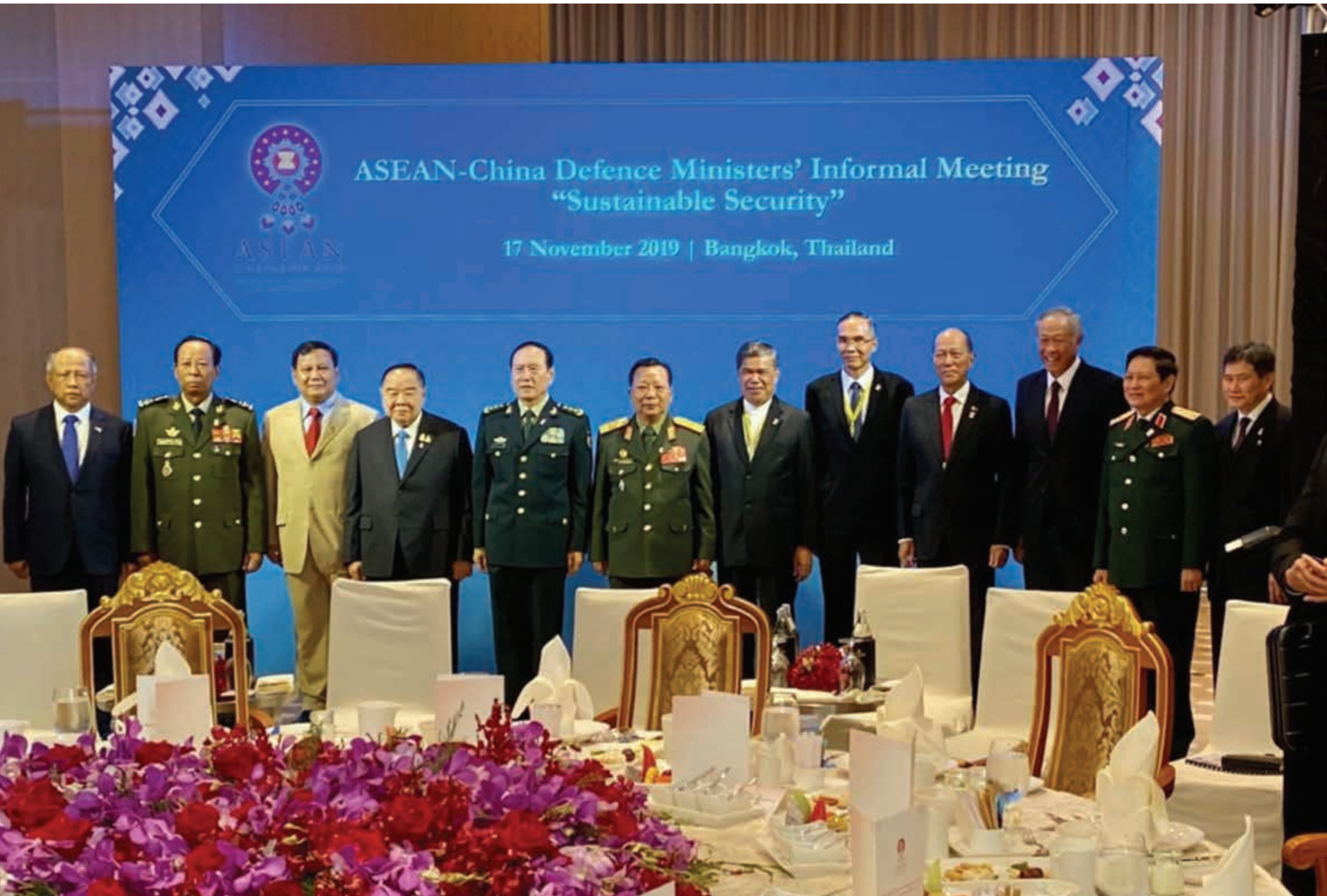
ASEAN-China Defence Ministers' Informal Meeting convened on 17 November 2019.