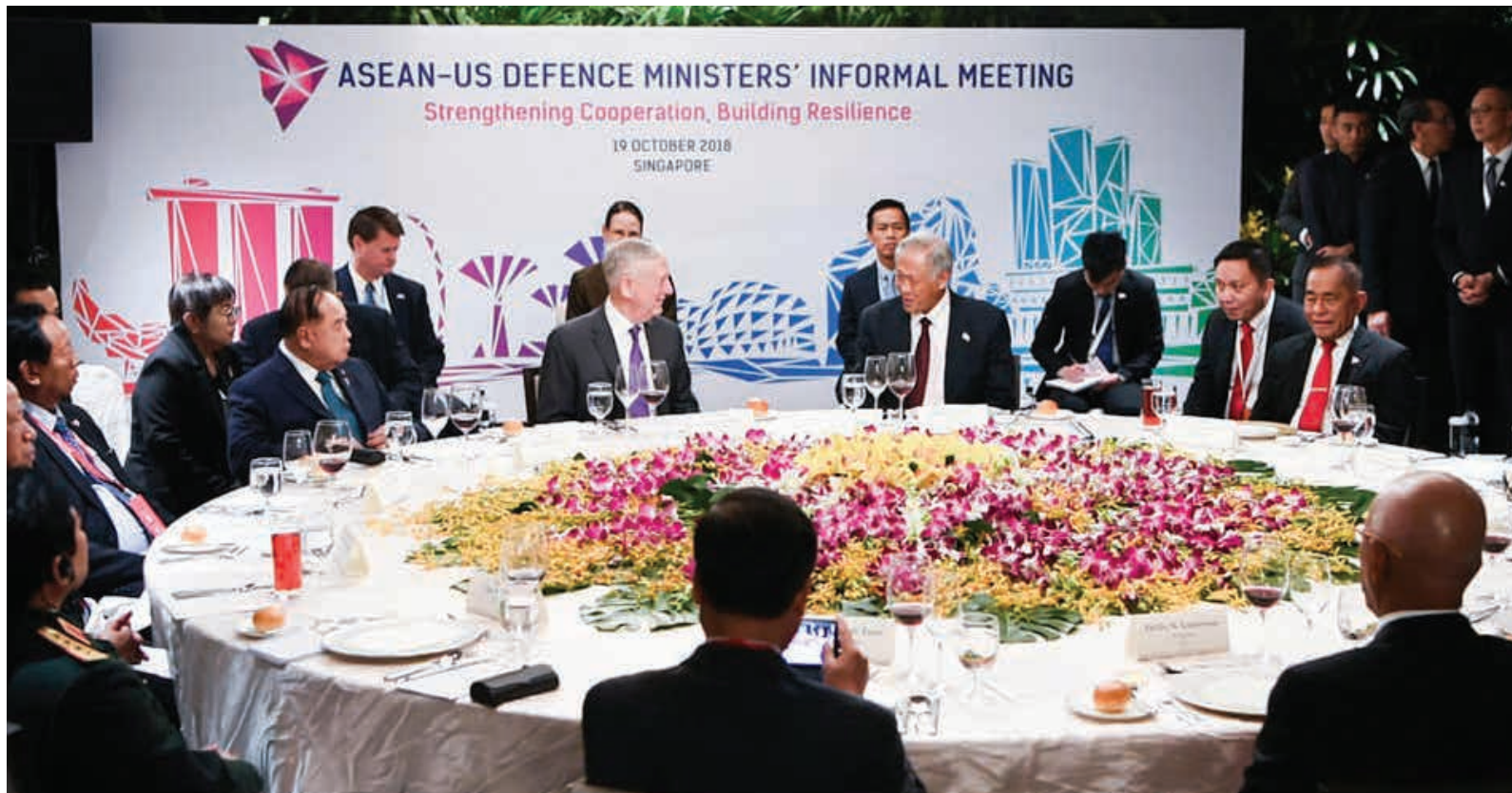
The ASEAN-US Defence Ministers' Informal Meeting was held over lunch and co-chaired by His Excellency Dr Ng Eng Hen, Minister for Defence, Singapore, and The Honourable James Norman Mattis (centre, in purple tie), U.S. Secretary of Defence on 19 October 2018.