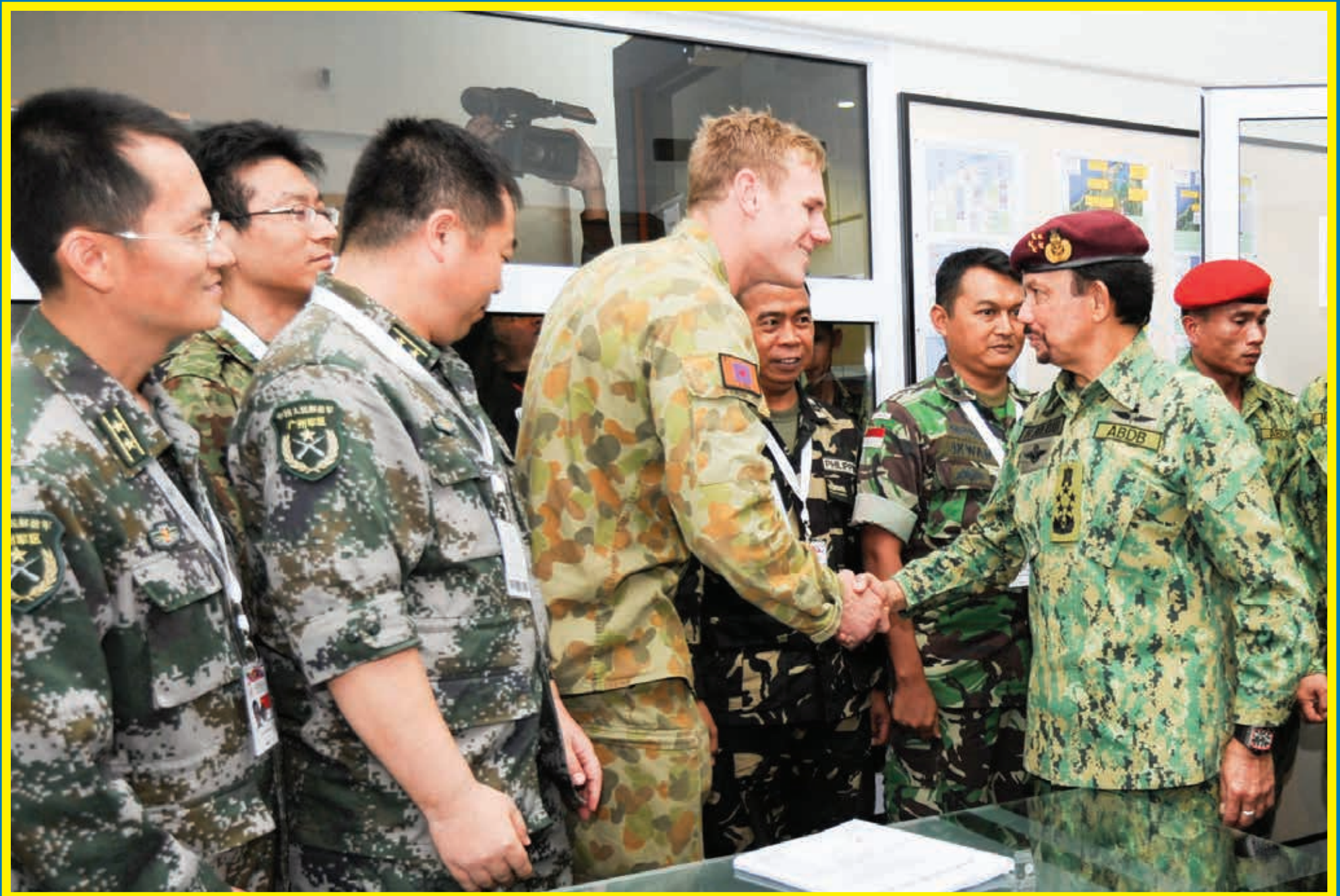
His Majesty the Sultan and Yang Di-Pertuan of Brunei Darussalam with ADMM and ADMM-Plus armed forces personnel during the first joint multi-national exercises of ADMM-Plus on Humanitarian Assistance and Disaster Relief and Military Medicine in 2013.