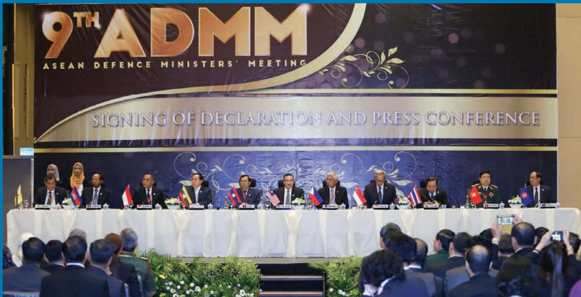
ASEAN Defence Ministers and representative signing the Joint Declaration at the conclusion of the 9 th ADMM, March 2015