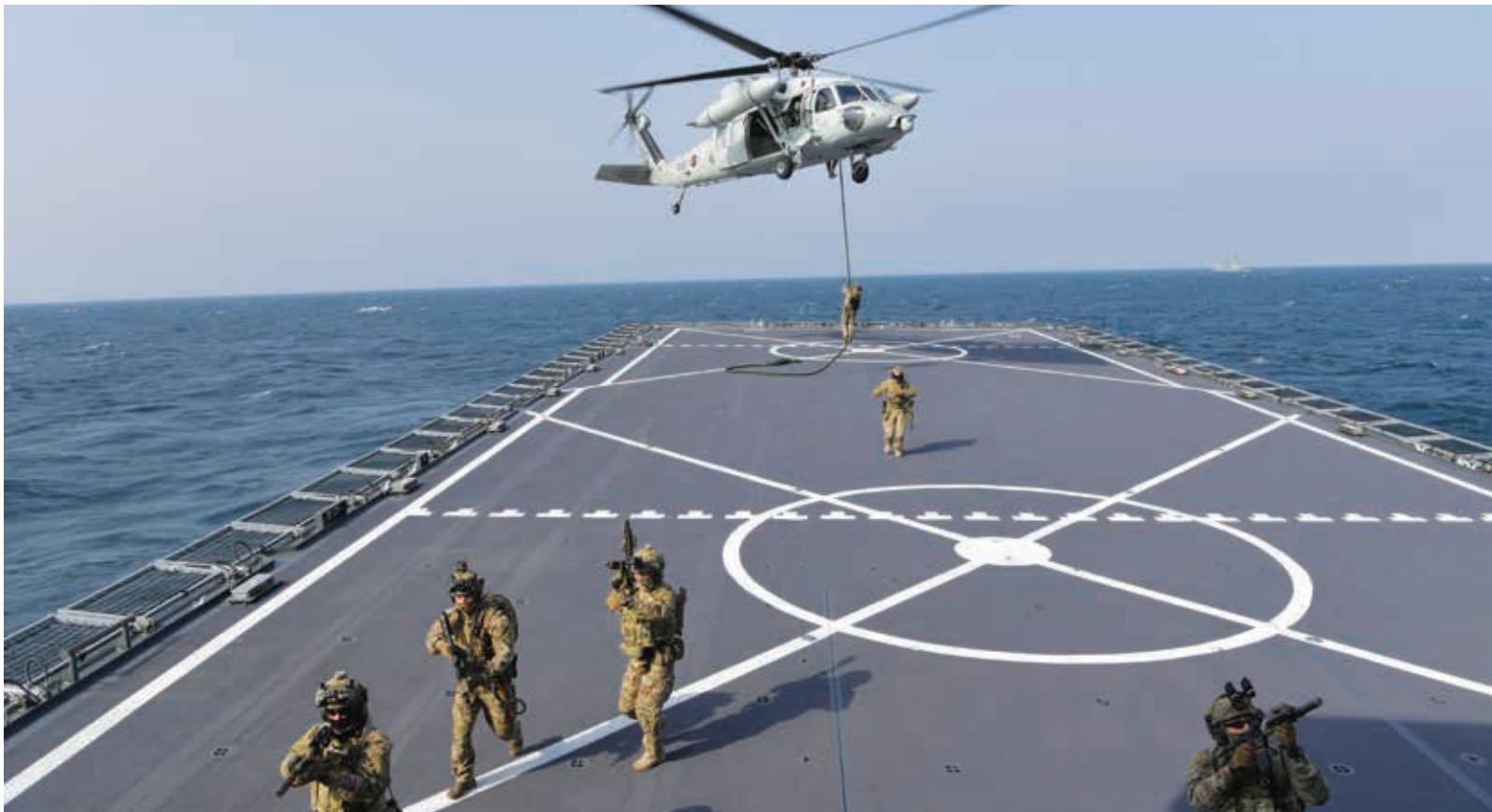
ADMM-Plus militaries conducting drills as part of the EWG on Maritime Security Field Training Exercise in May 2019.