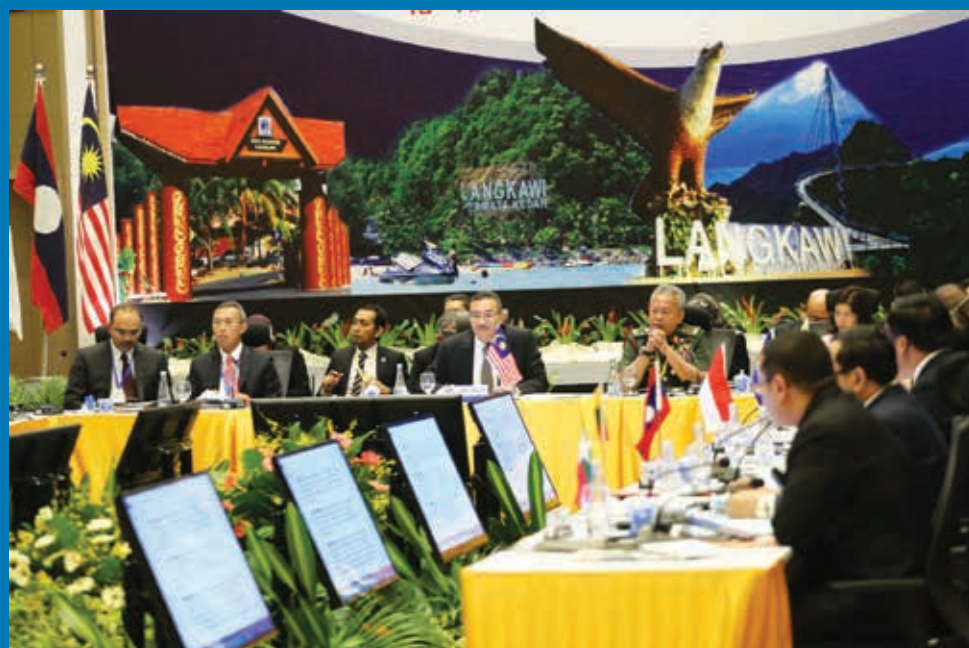
The Honourable Dato' Seri Hishammuddin bin Tun Hussein, Minister of Defence Malaysia, chaired the 9th ADMM in Langkawi, Malaysia in March 2015.