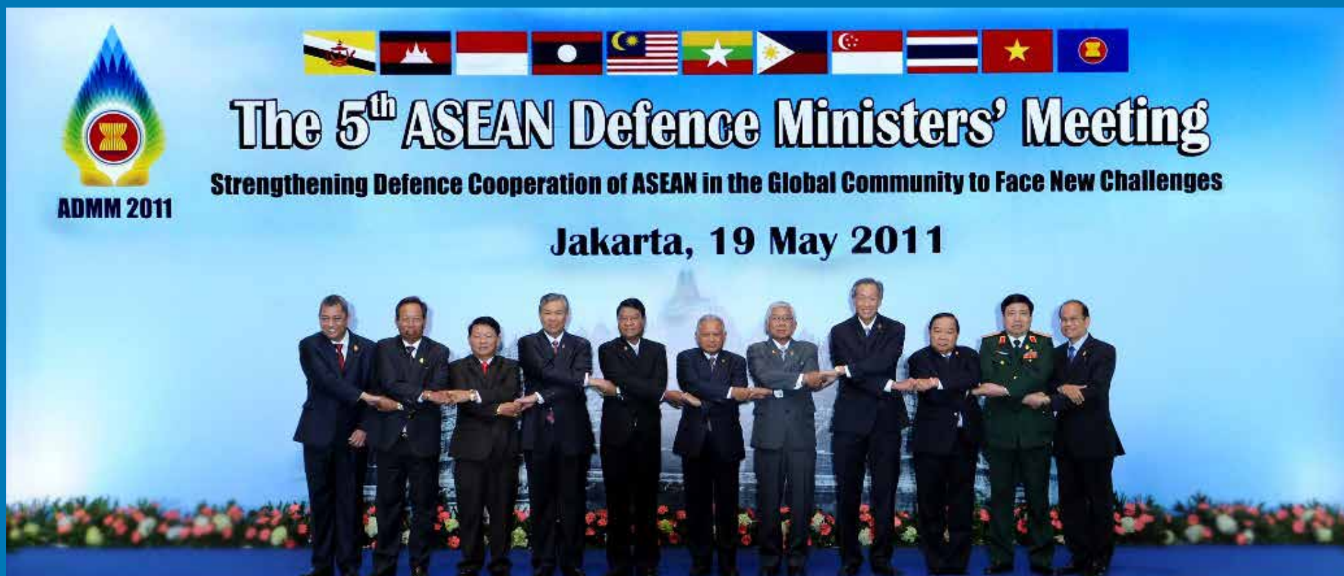
The 5th ADMM group photo