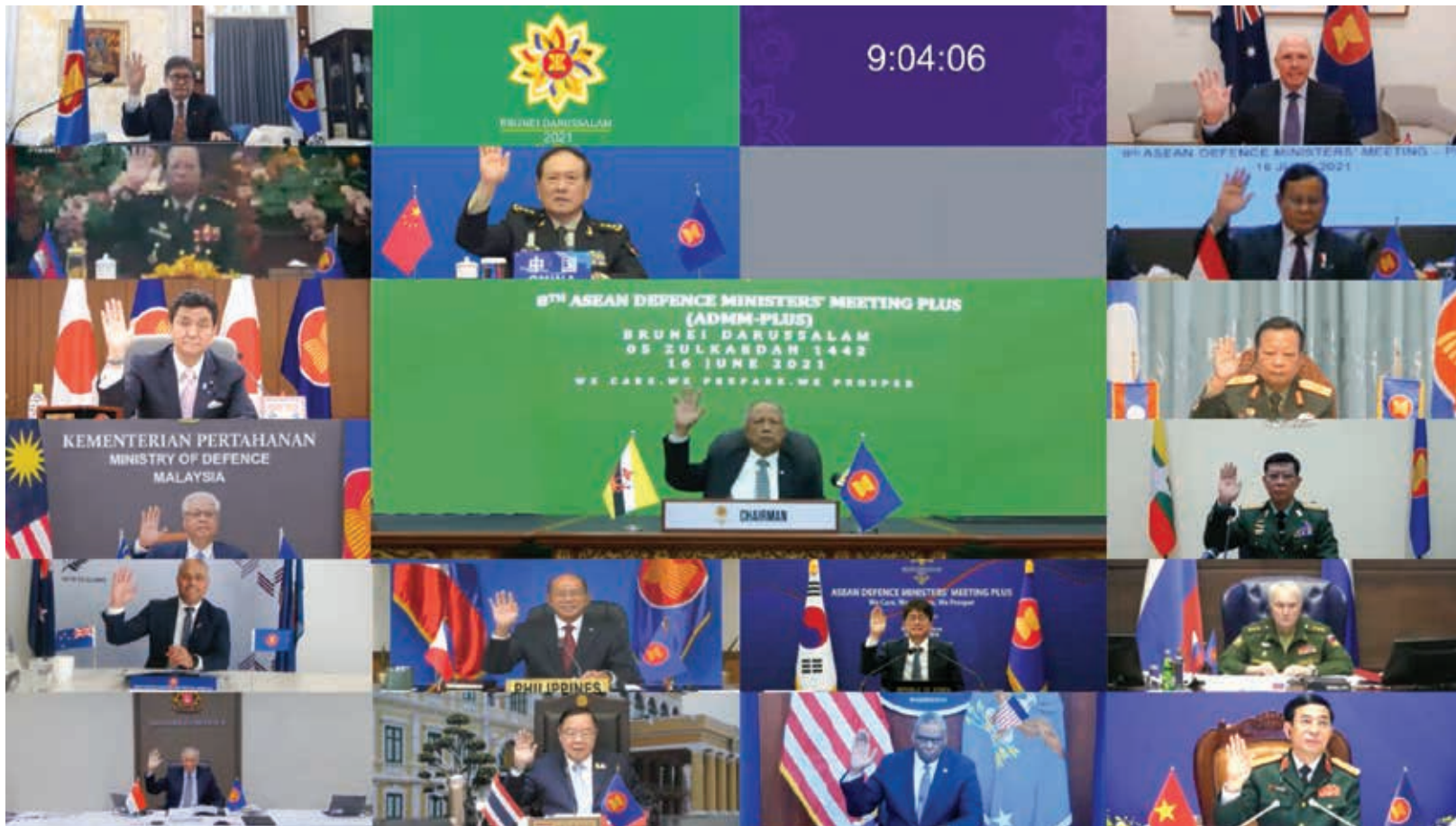
Virtual group photo of the 8th ADMM-Plus