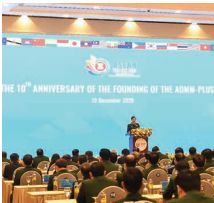
The 10th Anniversary of the Founding of the ADMM-Plus.