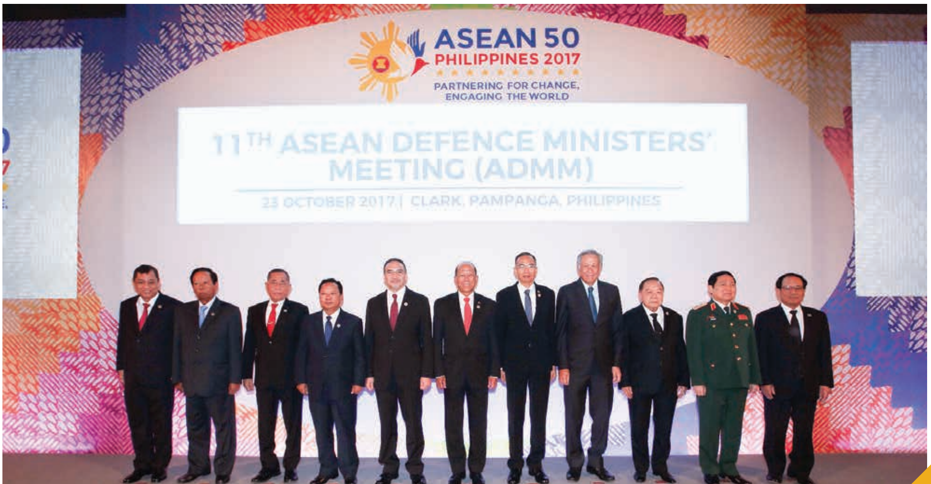
11th ADMM Family Photo, 23 October 2017