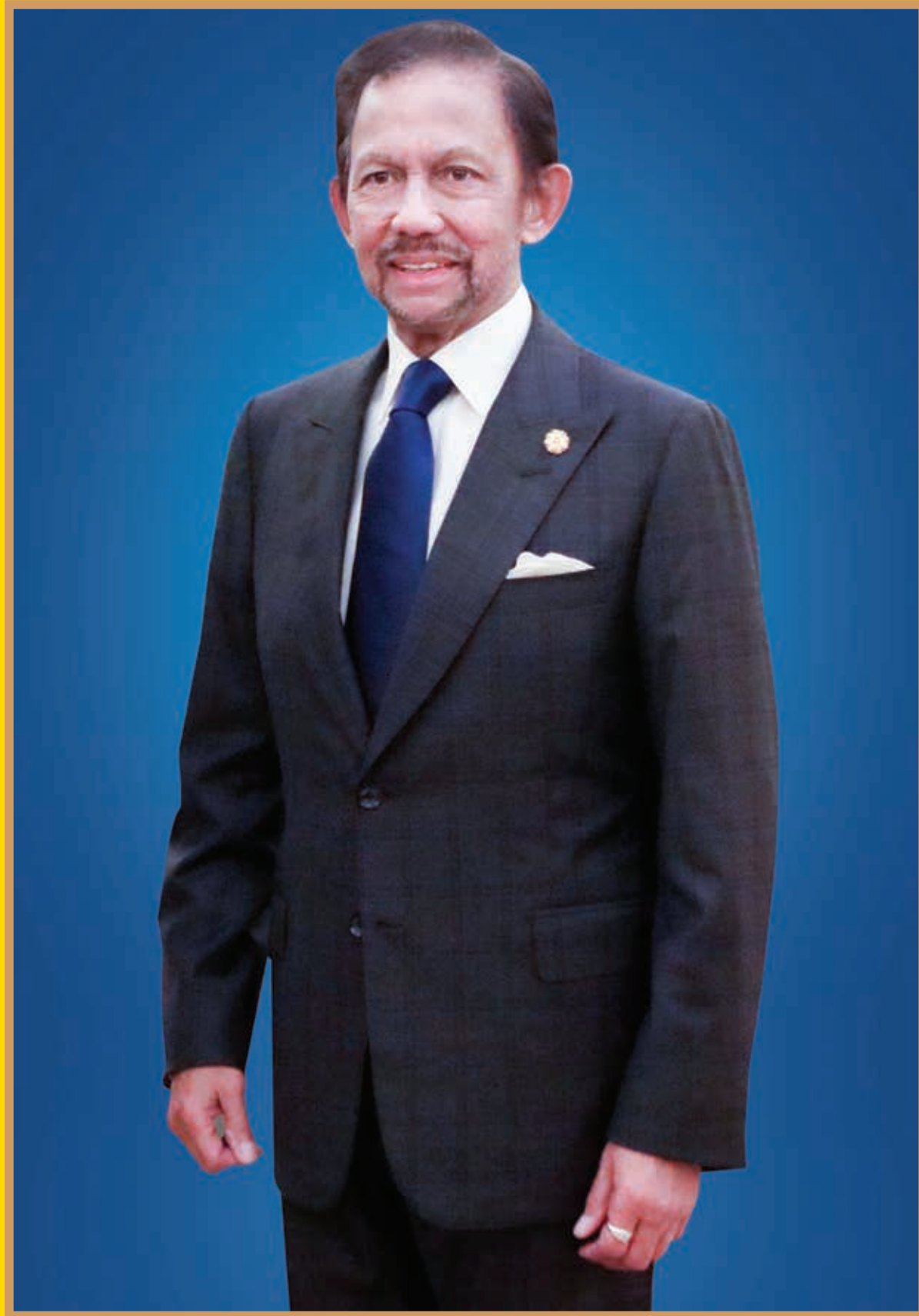
His Majesty Sultan Haji Hassanal Bolkiah Mu'izzaddin Waddaulah ibni Al-Marhum Sultan Haji Omar 'Ali Saifuddin Sa'adul Khairi Waddien, Sultan and Yang Di-Pertuan of Brunei Darussalam