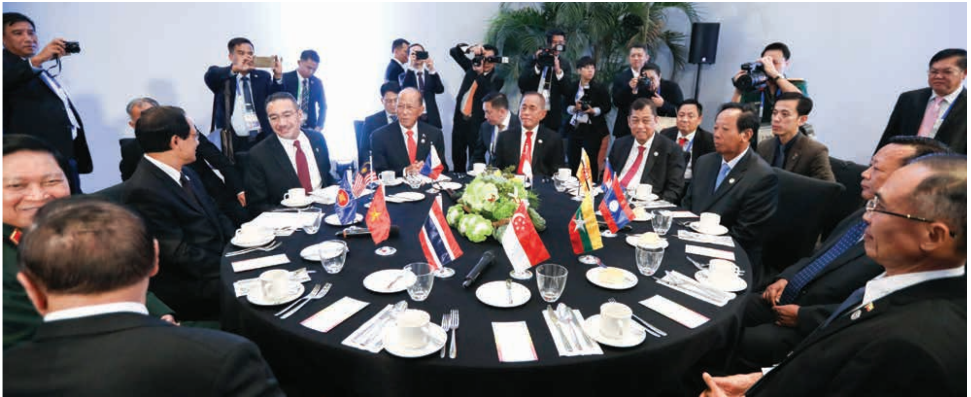
Special Breakfast Meeting on Countering Violent Extremism, Radicalization, and Terrorism among ASEAN Defence Ministers and Representative, 23 October 2017.