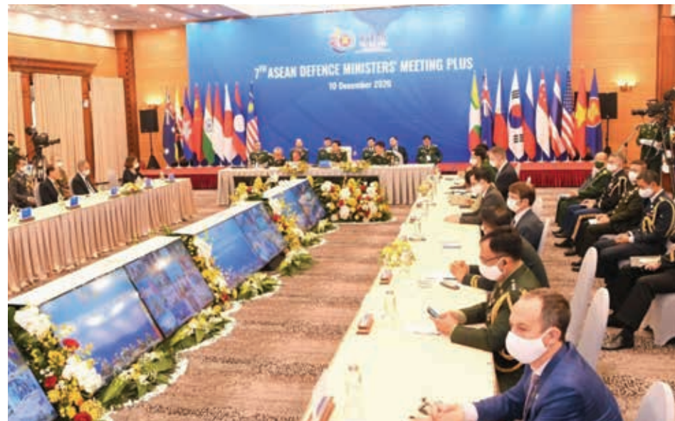
The 7th ADMM-Plus was held virtually on 10 December 2020.