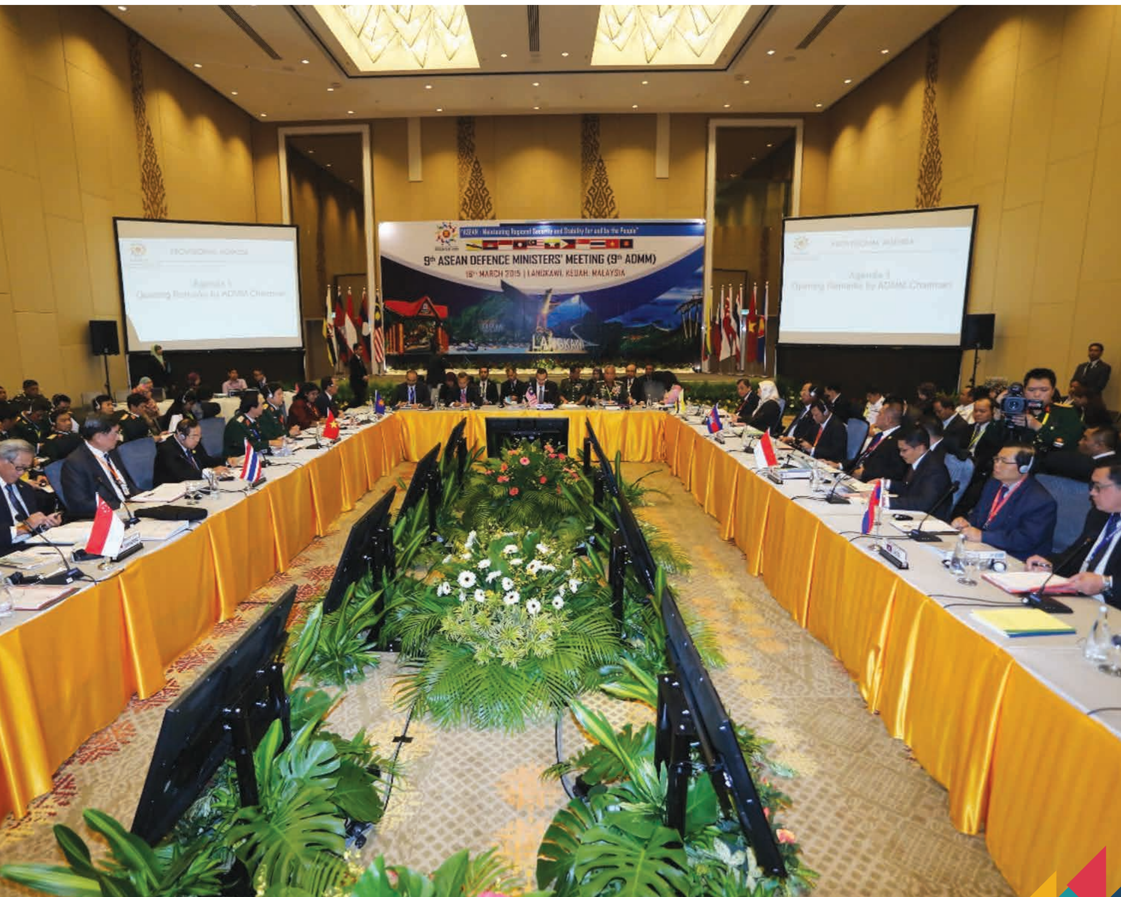
The 9 th ADMM was held in Langkawi, Malaysia in March 2015