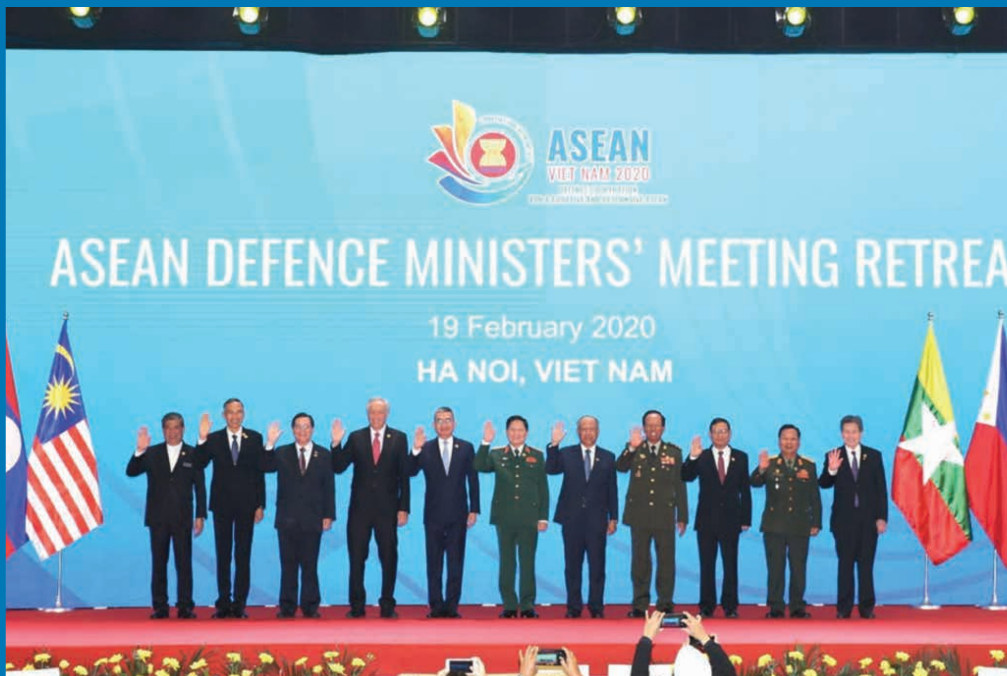
The ADMM Retreat on 19 February 2020.