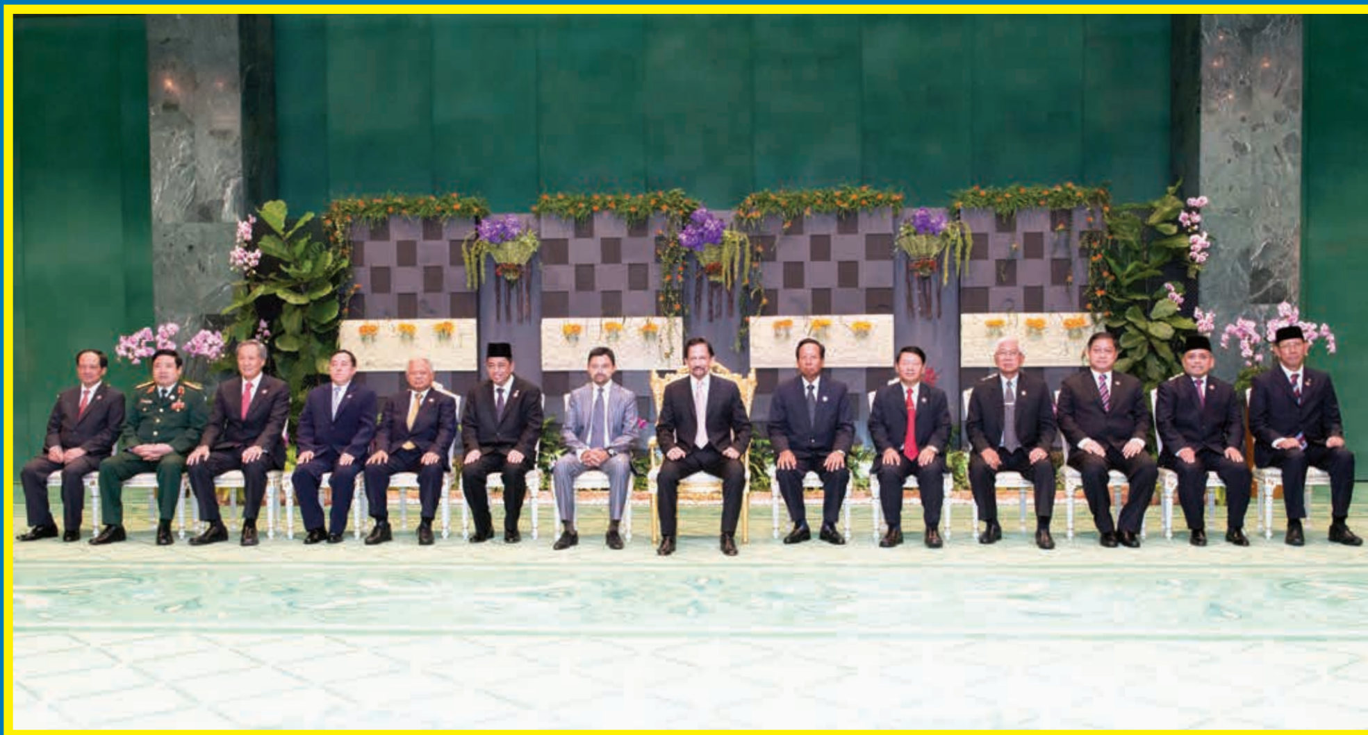
ASEAN Defence Ministers and Representative group photo with His Majesty Sultan and Yang Di-Pertuan of Brunei Darussalam and His Royal Highness the Crown Prince and Senior Minister at the Prime Ministers' Office during an Audience