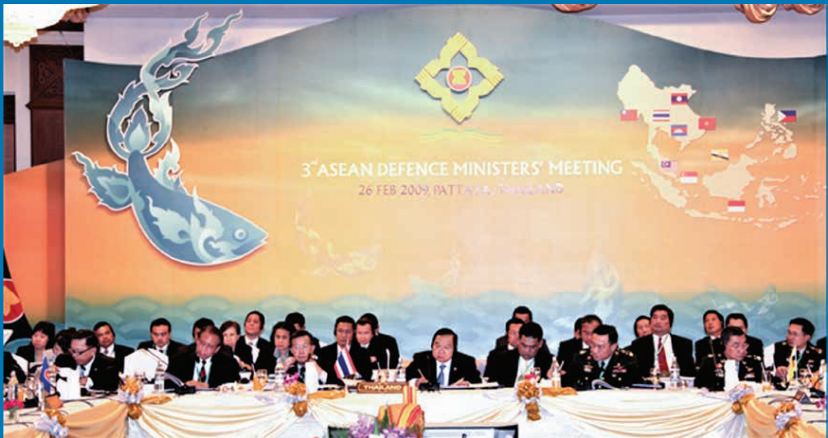
3rd ADMM, Pattaya, Thailand, 26 February 2009