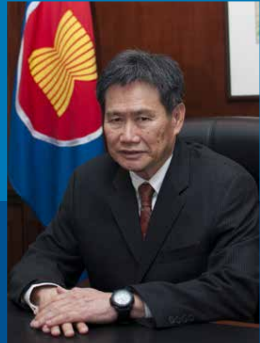
Dato Lim Jock Hoi Secretary-General of ASEAN

security architecture. More recently, the ADMM-Plus emerged as a tangible manifestation of the principles of the ASEAN Outlook on the Indo-Pacific (AOIP), which underlined ASEAN's bridging role to connect security partners from the Indian Ocean and Asia-Pacific region.