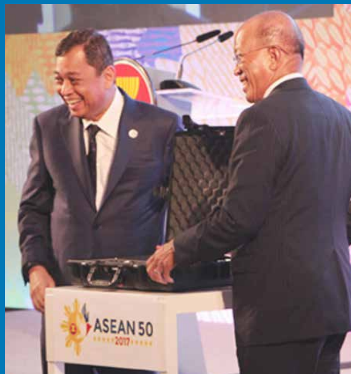
The launching of ASEAN Direct Communications Infrastructure (ADI) Phase 1 during the 4th ADMM-Plus