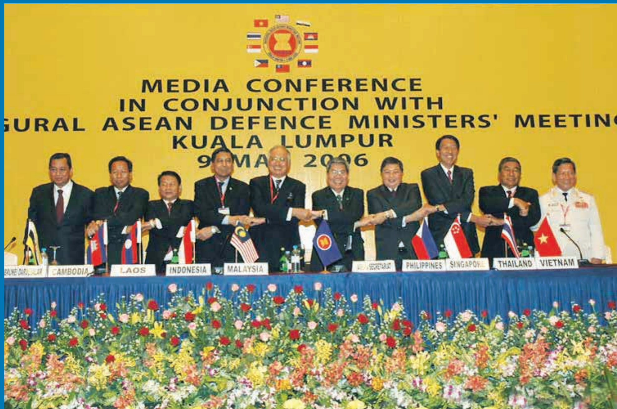
ASEAN Defence Ministers and Deputy Ministers pose for photograph during the media conference of the Inaugural ADMM, Kuala Lumpur, 2006. The meeting was chaired by The Right Honourable Dato' Sri Mohd Najib bin Tun Abdul Razak, Deputy Prime Minister and Minister of Defence of Malaysia.