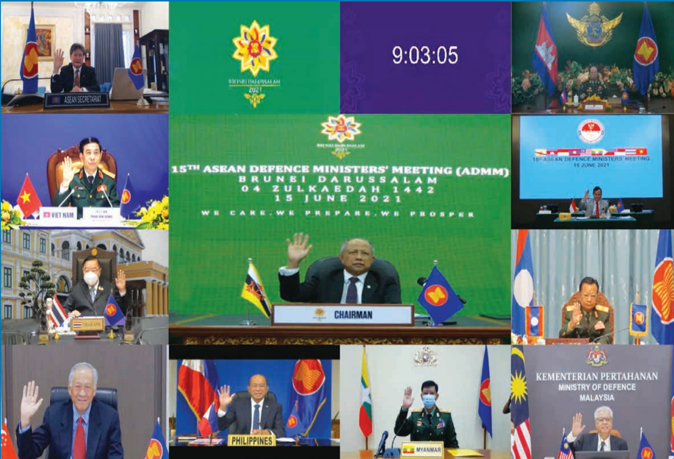
Virtual group photo of the 15th ADMM