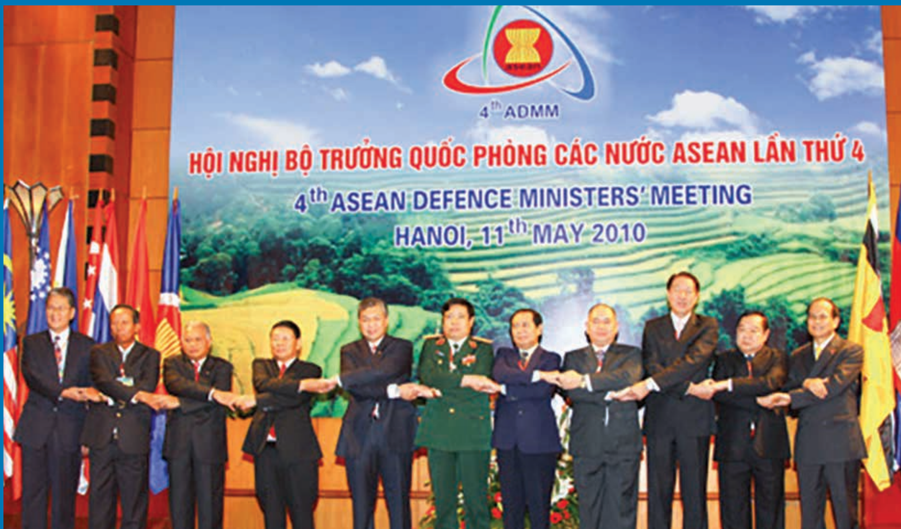
Opening Ceremony of the 4th ADMM