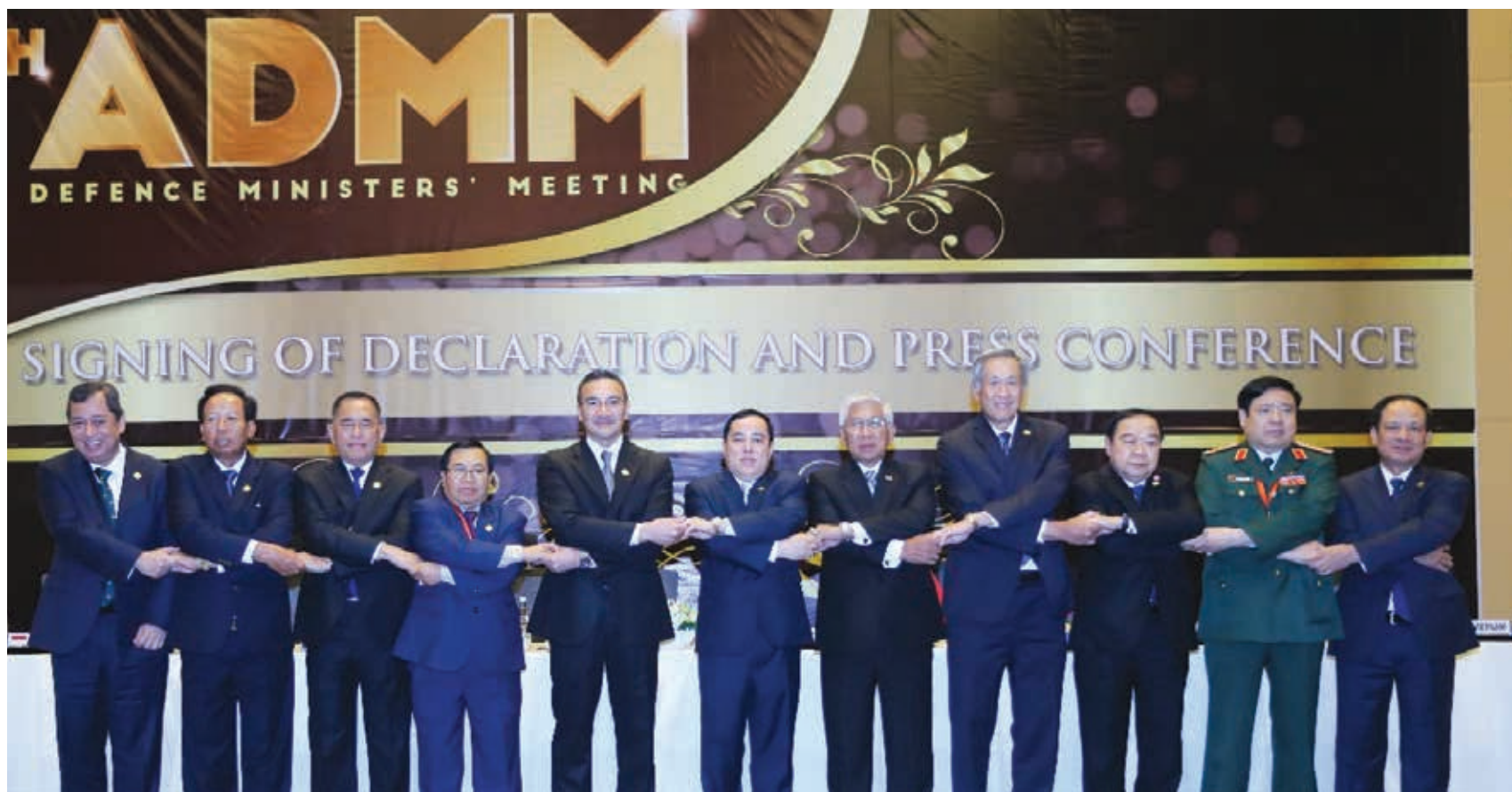
ASEAN Defence Ministers and representative pose for a photograph after signing the Joint Declaration of the 9th ADMM.

The Meeting expressed concerns on the rise of terrorism and radicalisation, as well as condemned the brutalities committed by terrorist groups. The Meeting agreed that regional cooperation is important in tackling terrorism as it is a transnational problem, and for the ADMM to explore ways to combat terrorism in the region. Among ways suggested to improve cooperation in countering terrorism and extremism are through information-sharing, surveillance, and promoting awareness among the public.