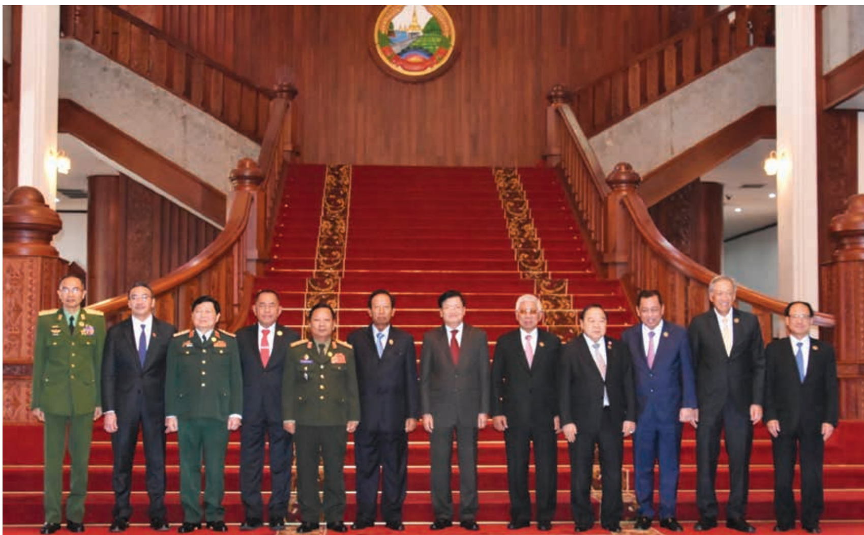
ASEAN Defence Ministers and ASEAN Secretary General paid the courtesy call on Prime Minister of Lao PDR, His Excellency Thongloun Sisoulith on 25 May 2016

At the sidelines of the 10th ADMM, ASEAN Defence Ministers, representatives as well as the Secretary-General of ASEAN attended an ASEAN-China Defence Ministers' Informal Meeting held on 25 May 2016. The Meeting discussed ways to further enhance and deepen ASEAN and China cooperation in defence as well as security issues including counter-terrorism, maritime security and border management.