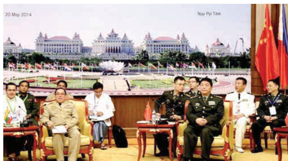
ASEAN-China Defence Ministers' Informal Meeting held on 20 May 2014