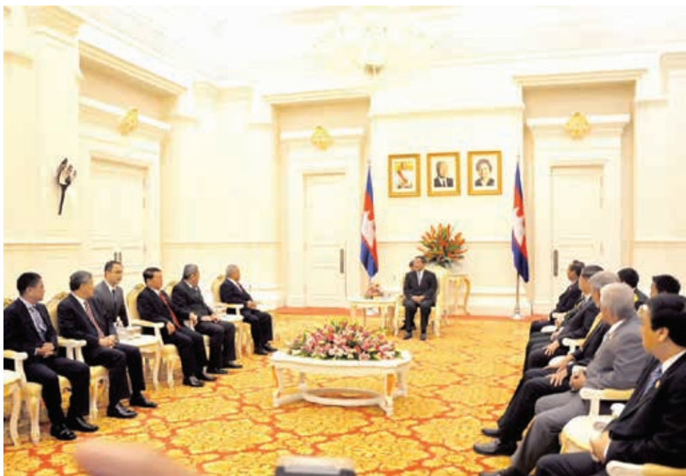
Courtesy Call on Samdech Techo Hun Sen, Prime Minister