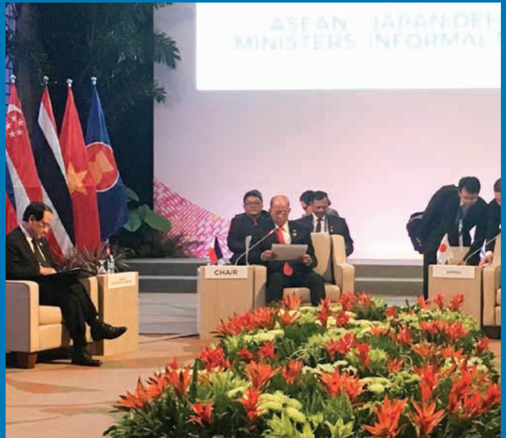
ASEAN-Japan Defence Ministers' Informal Meeting, 23 October 2017, ASEAN Convention Center