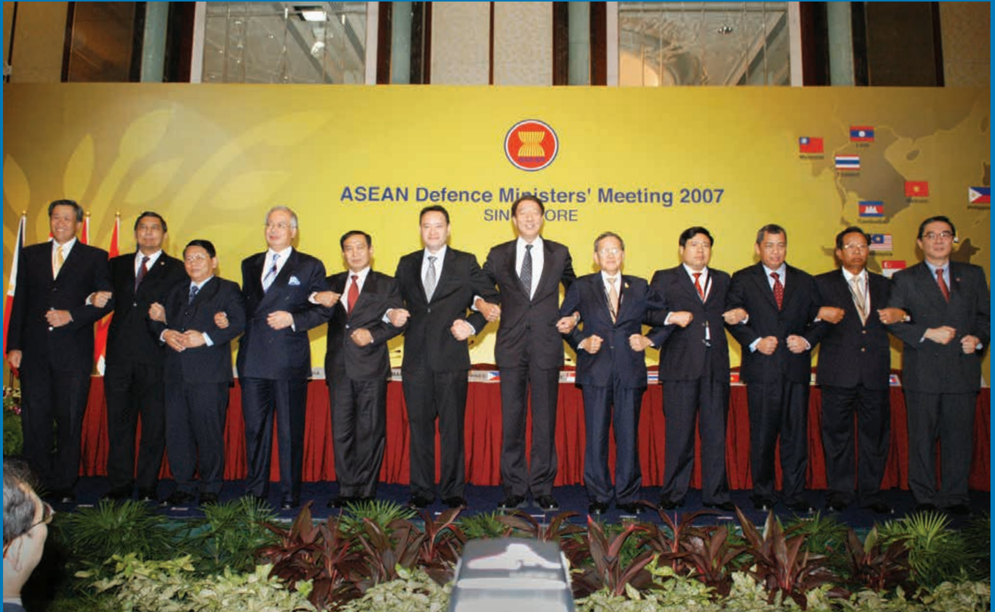
ASEAN Defence Ministers and Deputy Ministers joining arms for a group photo at the 2nd ADMM that was held in Singapore in November 2007.