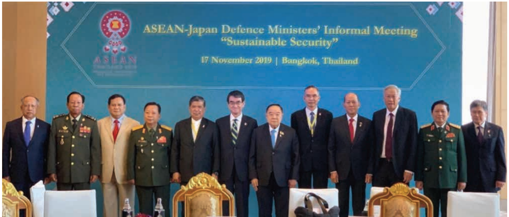
ASEAN-Japan Defence Ministers' Informal Meeting held on 17 November 2019.