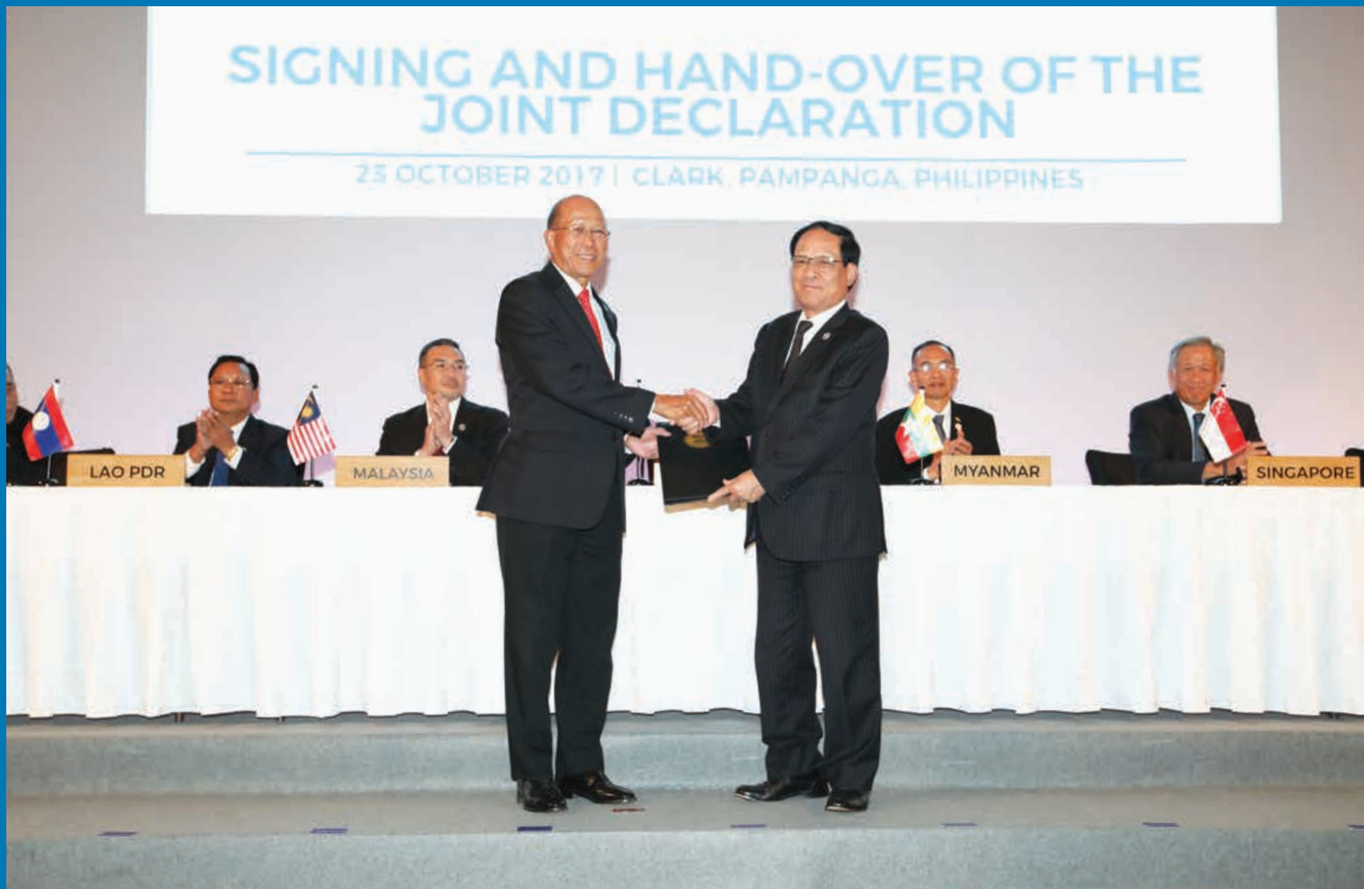
Handover of the 11th ADMM Joint Declaration by the Chair, Defence Secretary Delfin N. Lorenzana, to the ASEAN Secretary-General, His Excellency Le Luong Minh, 23 October 2017, ASEAN Convention Center