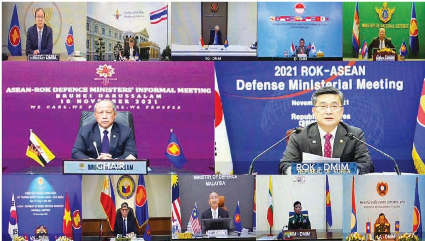
The Inaugural ASEAN-Republic of Korea Defence Ministers' Informal Meeting