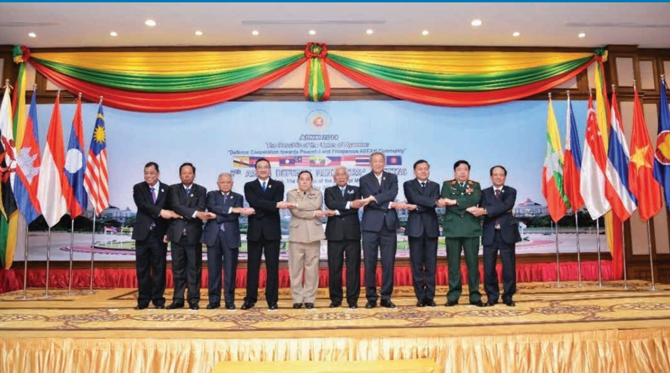
ASEAN Defence Ministers and representatives in a group photo at 8th ADMM, Nay Pyi Taw, Myanmar, 2014.