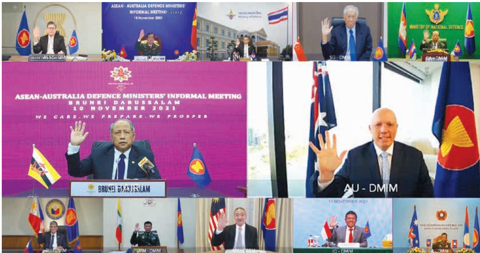
The ASEAN-Australia Defence Ministers' Informal Meeting