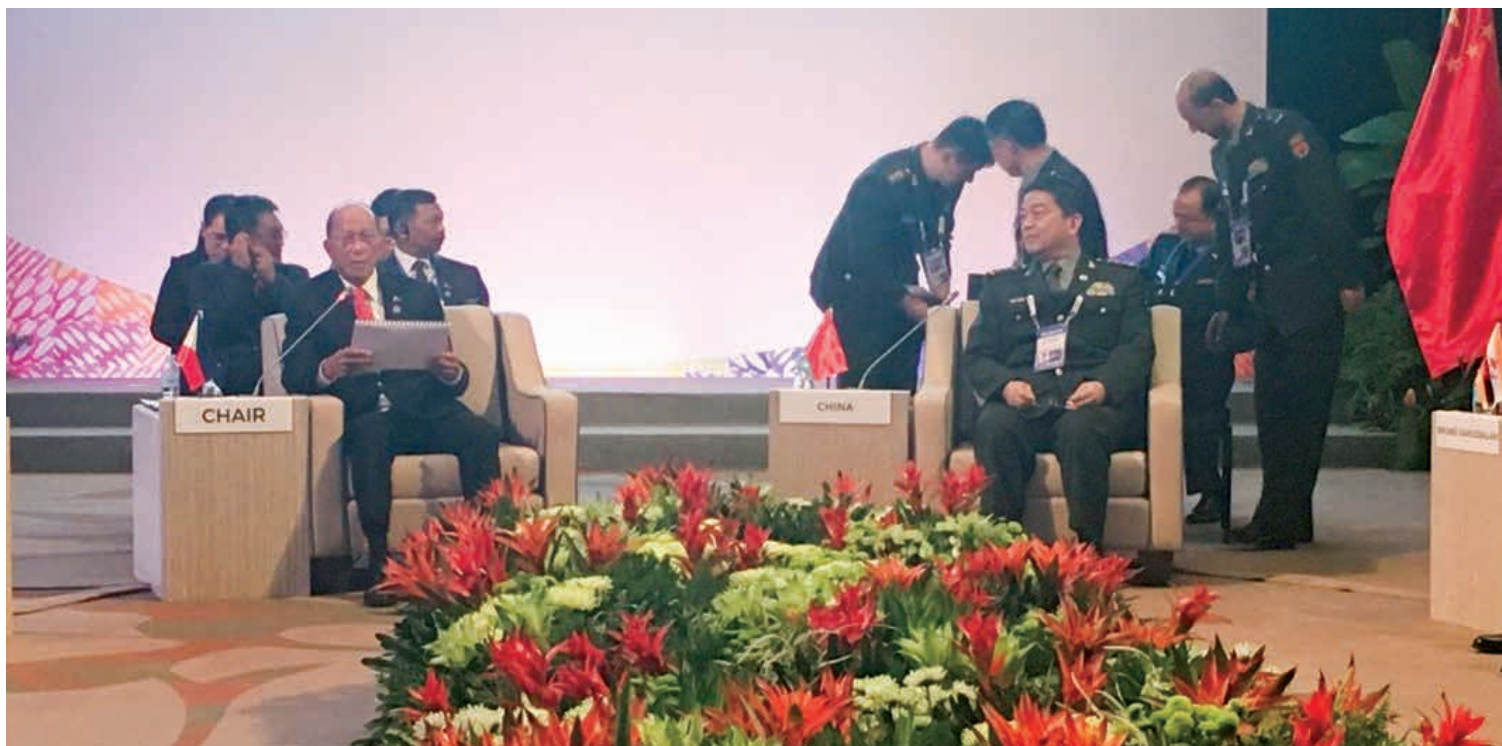
ASEAN-China Defence Ministers' Informal Meeting, 23 October 2017, ASEAN Convention Center

Meanwhile, the 4th ADMM-Plus Leaders shared their views on regional and international defence and security issues. It was also announced that starting 2018, the ADMM-Plus will be convened annually. The ASEAN Direct Communications Infrastructure Phase I was also launched at the 4th ADMM-Plus.