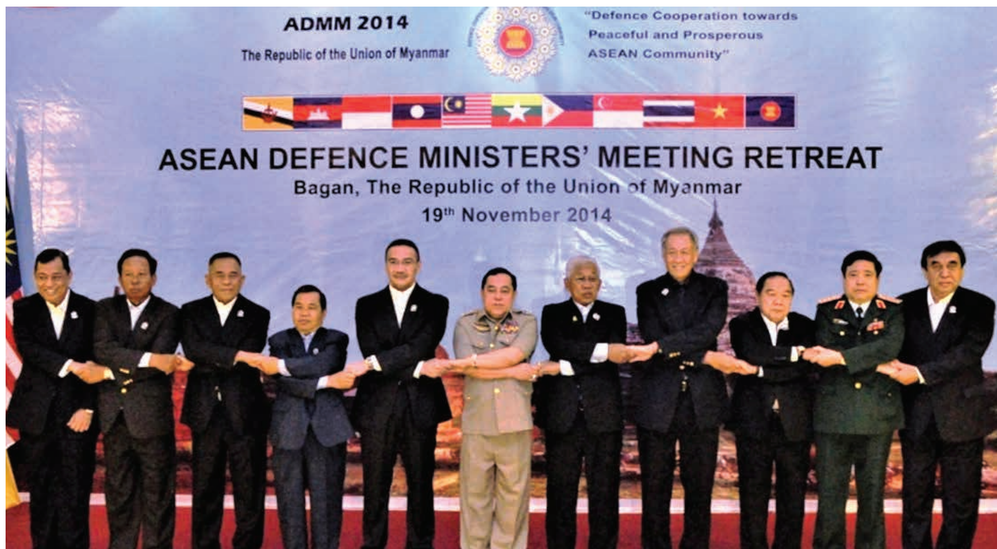
Group photo of the ADMM Retreat held 19 November 2014