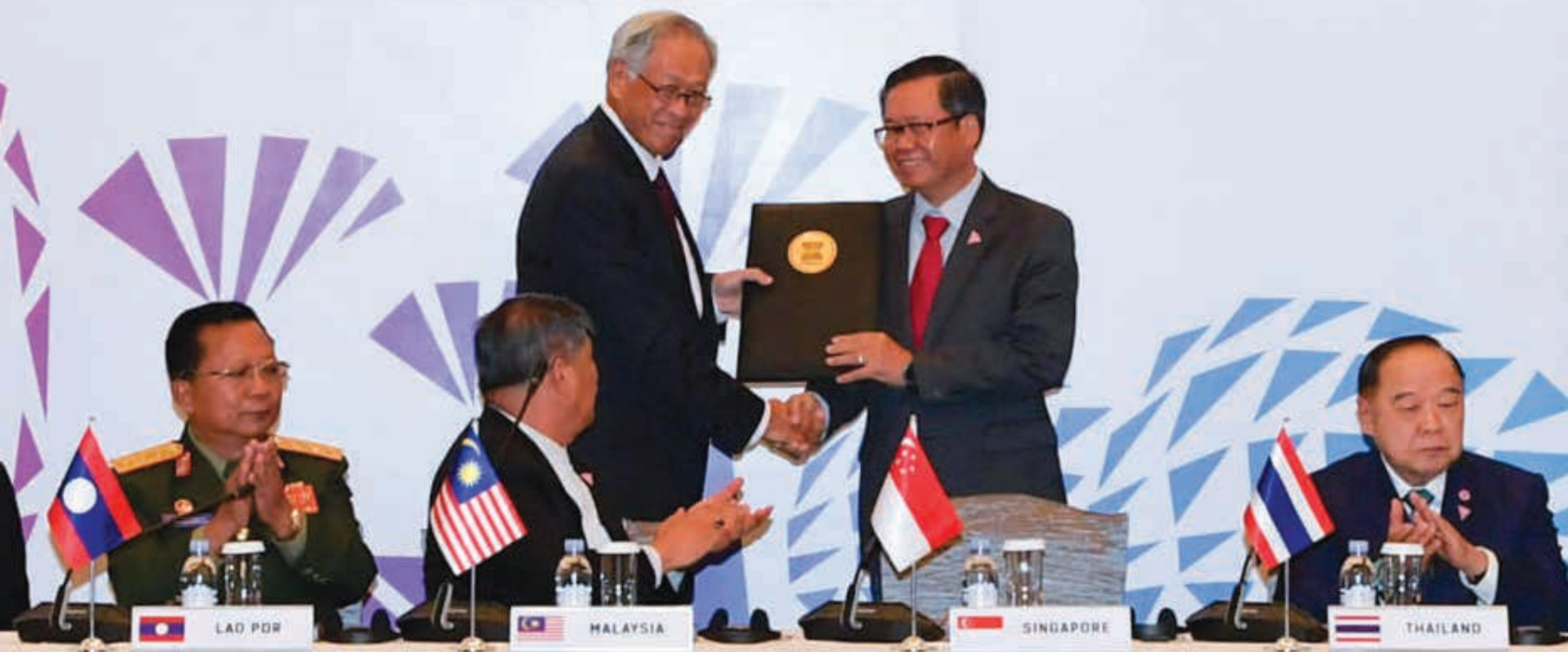
Dr Ng Eng Hen, Minister for Defence, Singapore (standing, left) presenting the signed Joint Declaration to the Deputy Secretary-General of ASEAN for the ASEAN Political-Security Community Dr Hoang Anh Tuan.