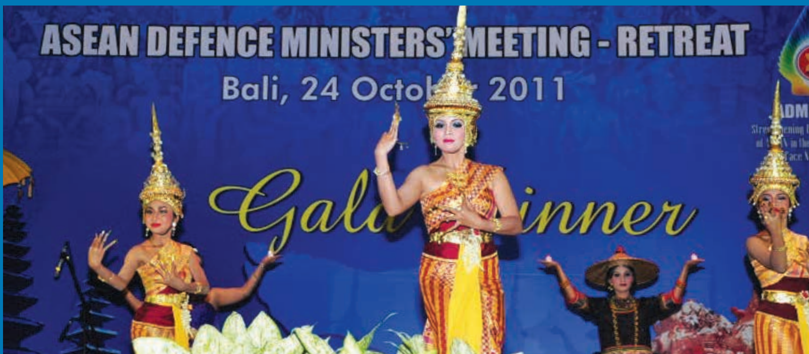
His Excellency Minister Purnomo Yusgiantoro, the then Minister of Defence of the Republic of Indonesia hosted a Gala Dinner during the ASEAN Defence Ministers' Meeting Retreat (ADMM Retreat) on 24 October 2011 in Nusa Dua, Bali.