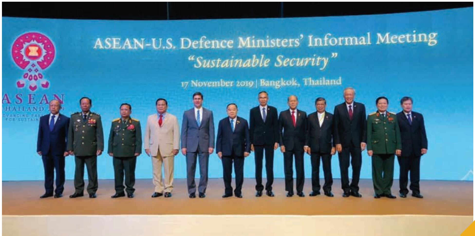
ASEAN-US Defence Ministers' Informal Meeting held on 17 November 2019.