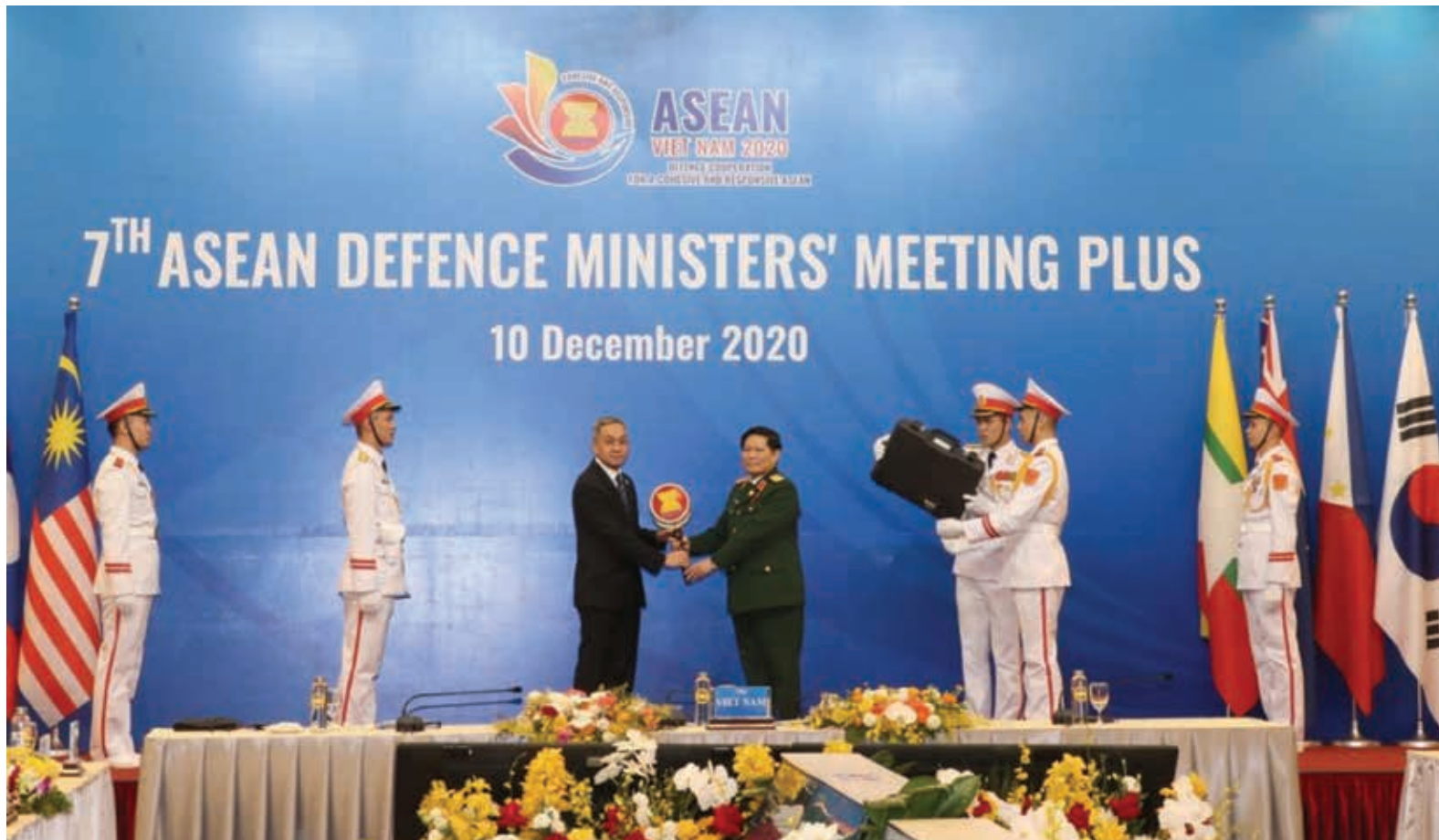
Handover of ADMM Chairmanship to Brunei Darussalam

The year 2020 was also a special year for defence cooperation in ASEAN, especially with its Dialogue Partners, as it marked the 10th anniversary of the founding of the ADMM-Plus. A commemorative event was organised on 10 December 2020 to celebrate this milestone, which included a one-off “Guests of the Chair” session to further grace the event