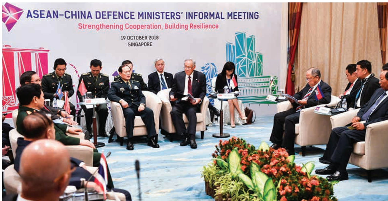
Dr Ng Eng Hen, Minister for Defence Singapore, and His Excellency General Wei Fenghe, State Councilor and Minister of National Defence, at the ASEAN-China Defence Ministers' Informal Meeting on 19 October. In his first meeting with the ASEAN Defence Ministers, General Wei said that China was committed to building closer ties with ASEAN.