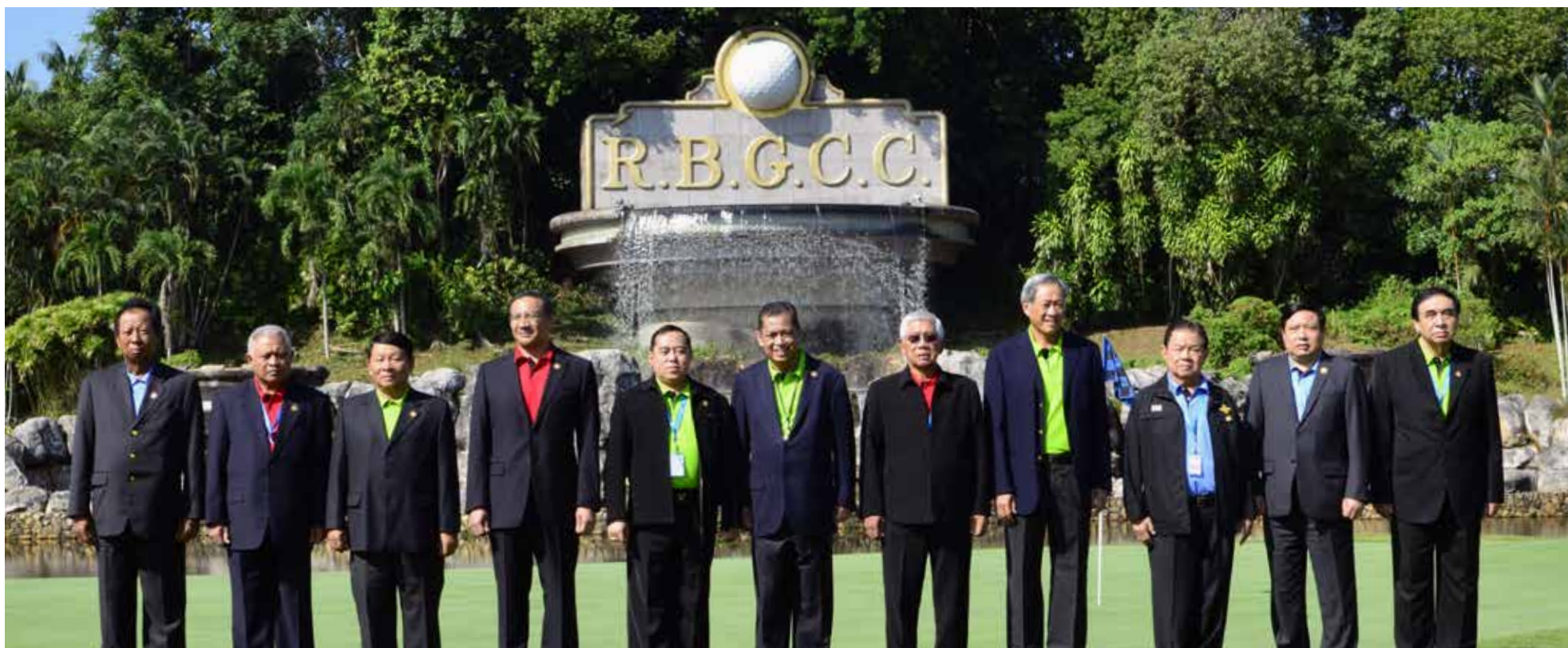
Delegates of the 7th ASEAN Defence Ministers' Meeting Retreat (ADMM Retreat), Bandar Seri Begawan, Brunei Darussalam, 28 August 2013.