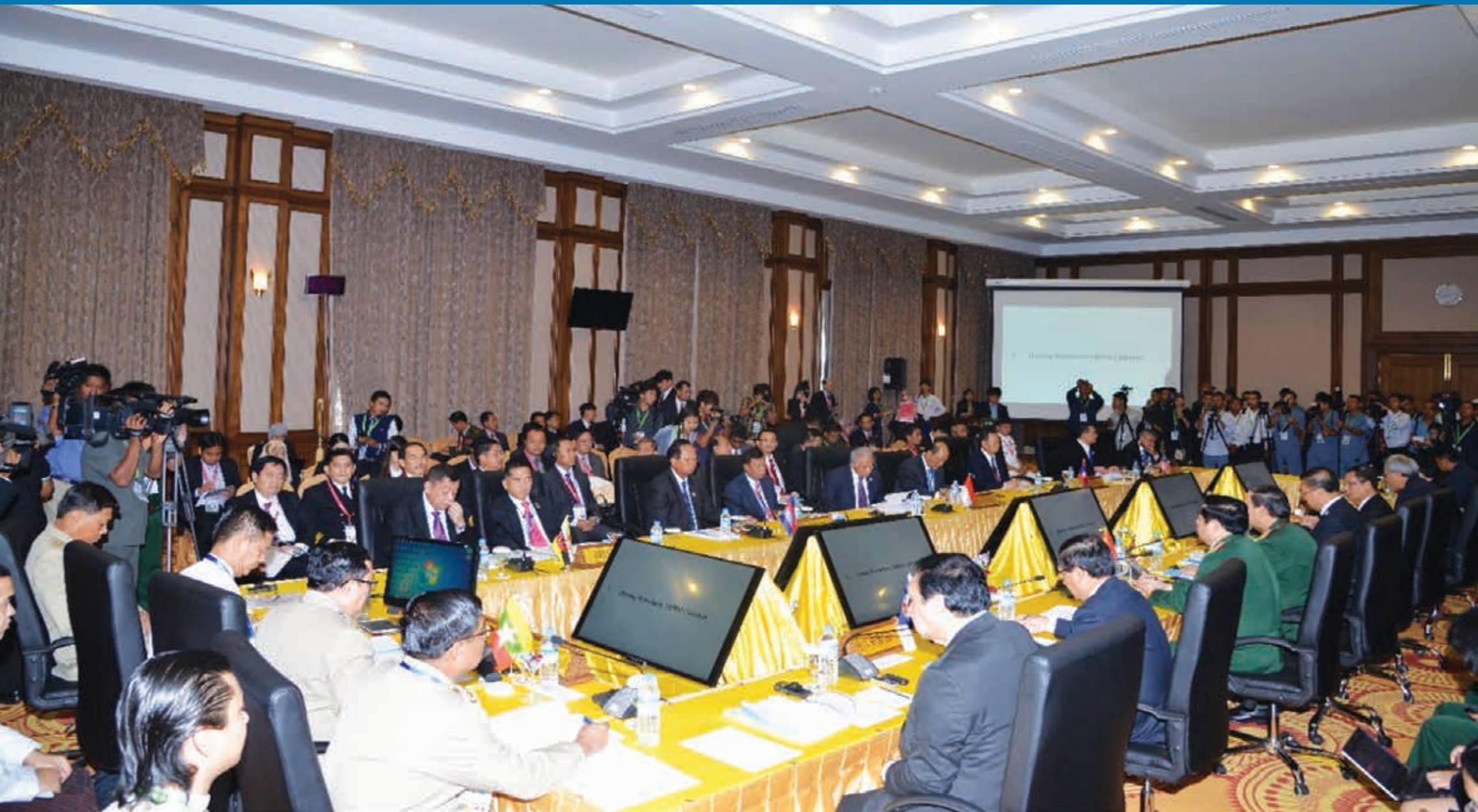
The 8th ADMM in session at Nay Pyi Taw, Myanmar, 2014.