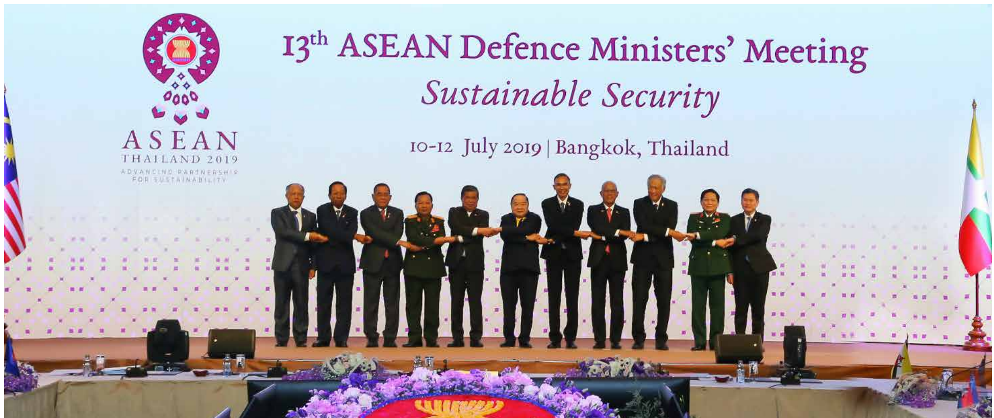
13th ADMM, Bangkok, Thailand, 11 July 2019.