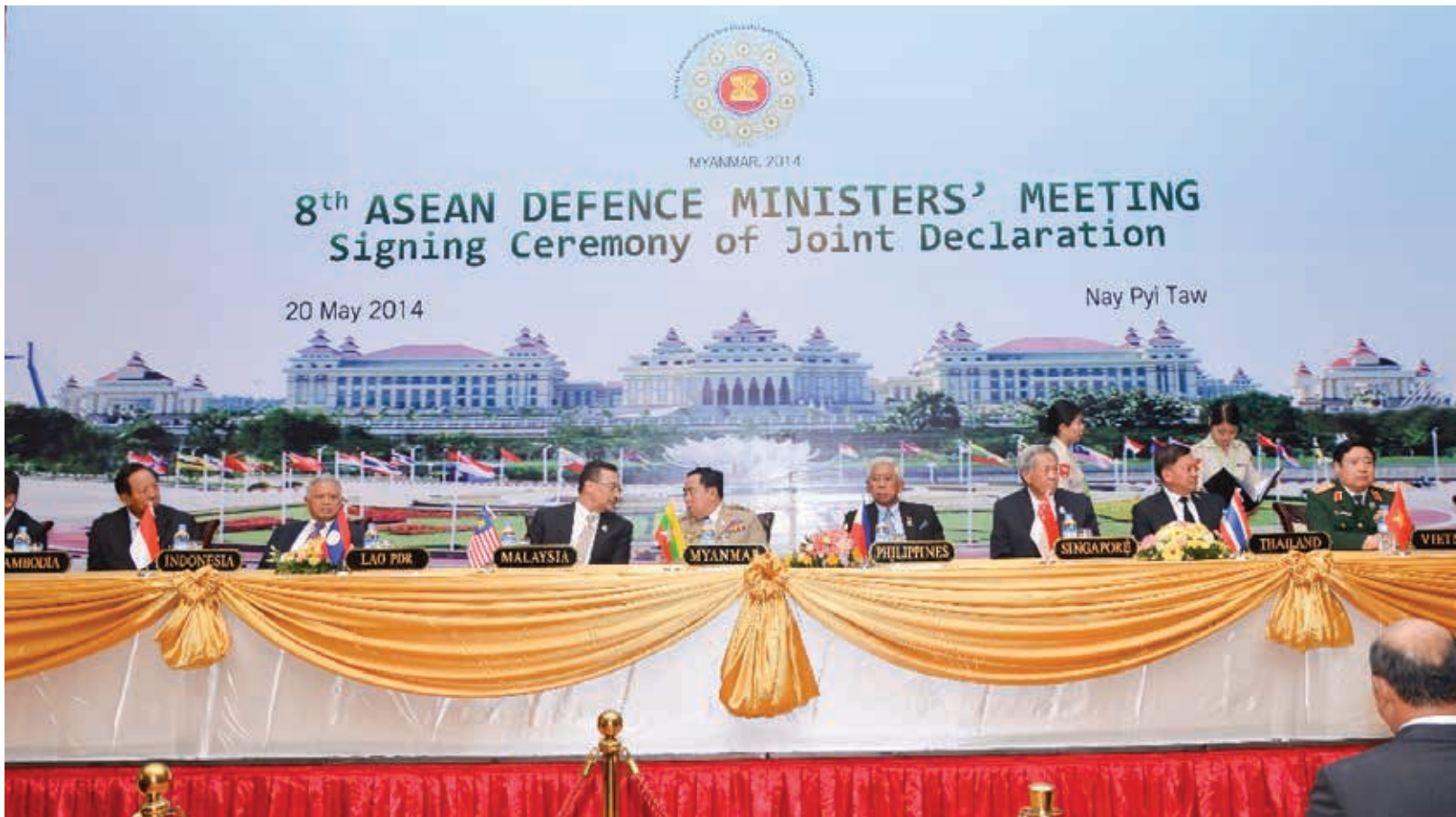
Signing Ceremony on 8 th ADMM Joint Declaration by ASEAN Defence Ministers and representative at 8 th ADMM