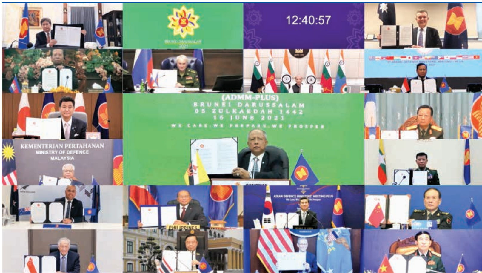
Adoption of the Bandar Seri Begawan Declaration by the ADMM-Plus in Commemoration of the 15th Anniversary of the ADMM Towards A Future-Ready, Peaceful and Prosperous ASEAN