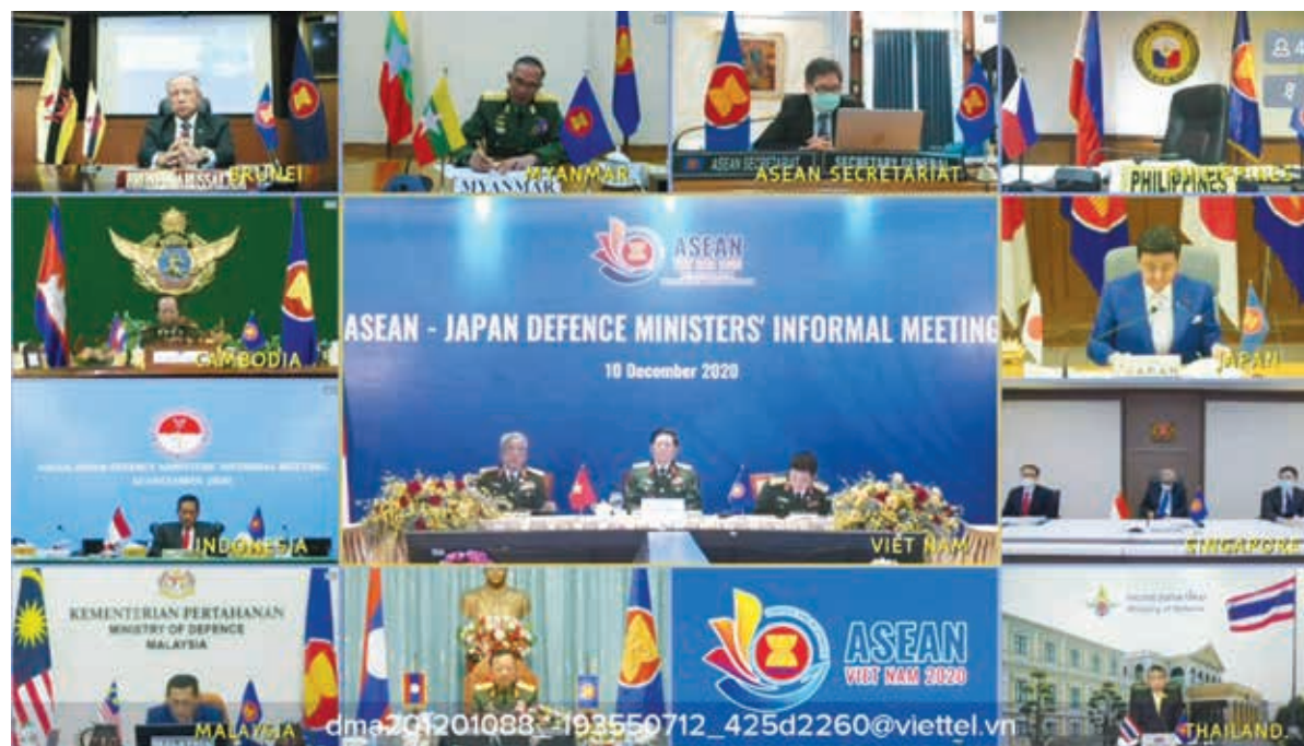
ASEAN-Japan Defence Ministers' Informal Meeting held on 10 December 2020.