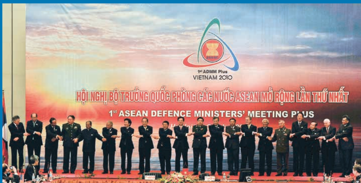
The inaugural ADMM-Plus in Ha Noi, on 12 October 2010