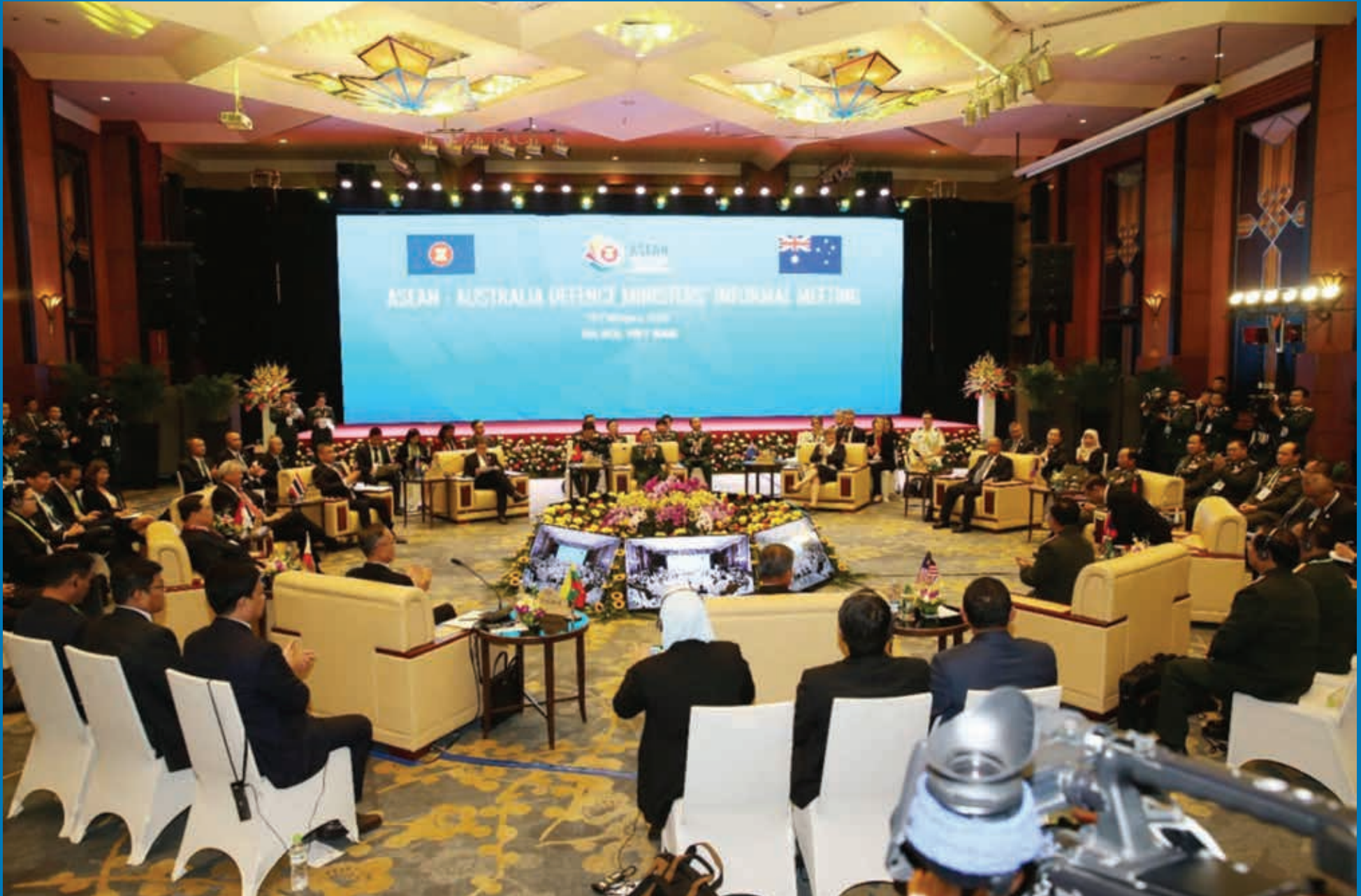
ASEAN-Australia Defence Ministers' Informal Meeting held on the sidelines of ADMM Retreat on 19 February 2020