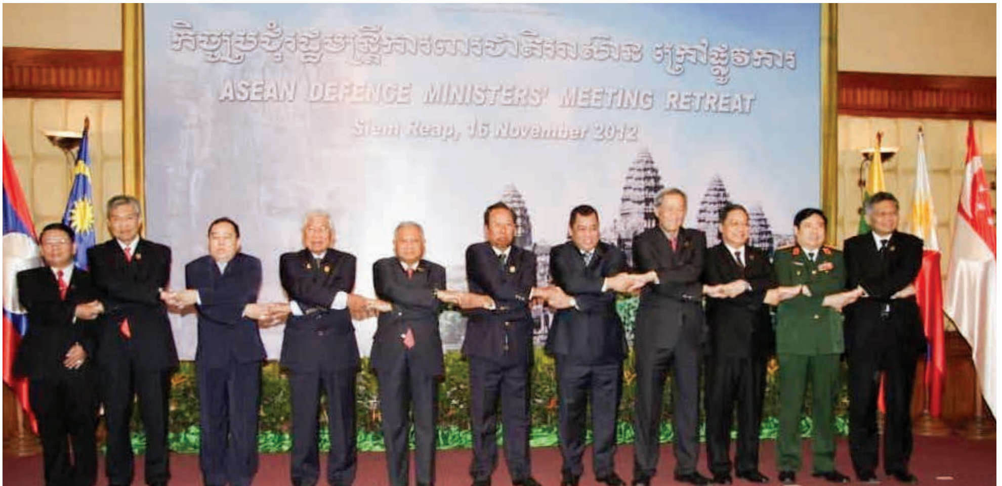
ADMM Retreat on 16 November 2012, Siem Reap, Cambodia