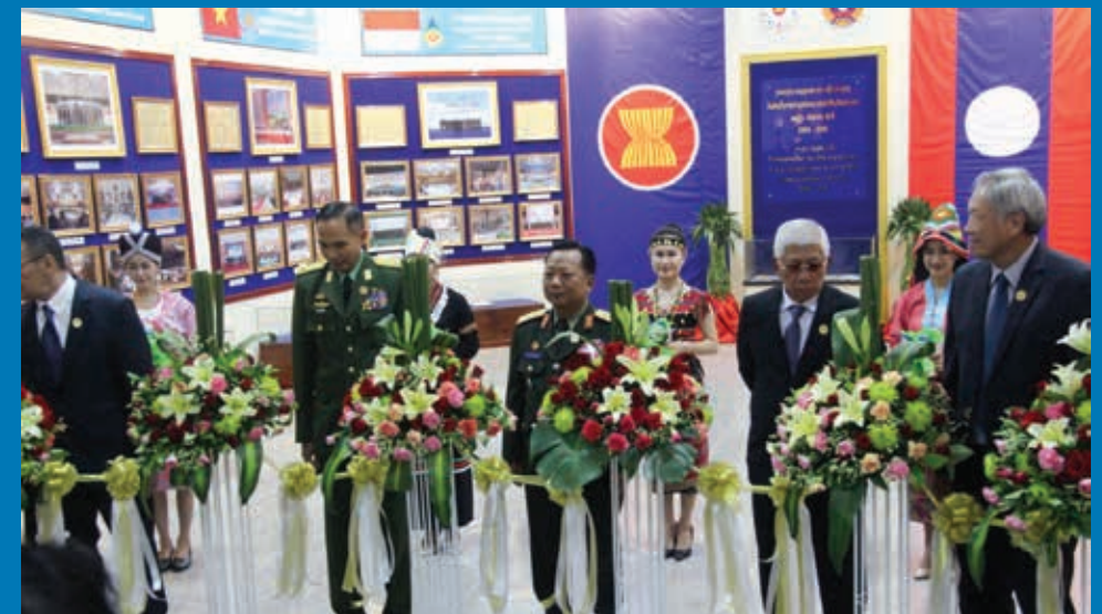
Opening Ceremony of ADMM Gallery at Lao People's Army Museum on 26 May 2016