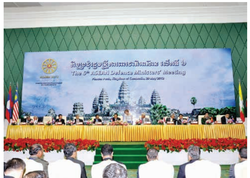
6th ADMM Joint Declaration Signing Ceremony