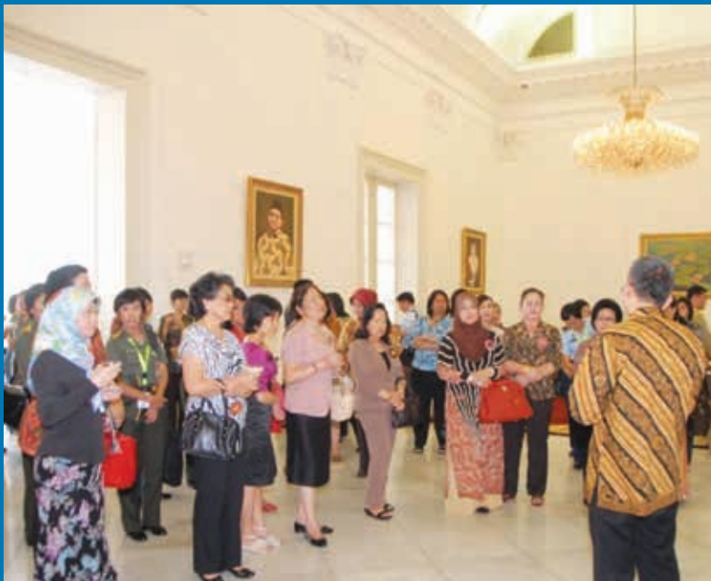
During the 5th ADMM, Ministers and representatives' spouses had an opportunity to visit the Bogor Presidential Palace, where the President and his family live, as part of the Ladies Programme.