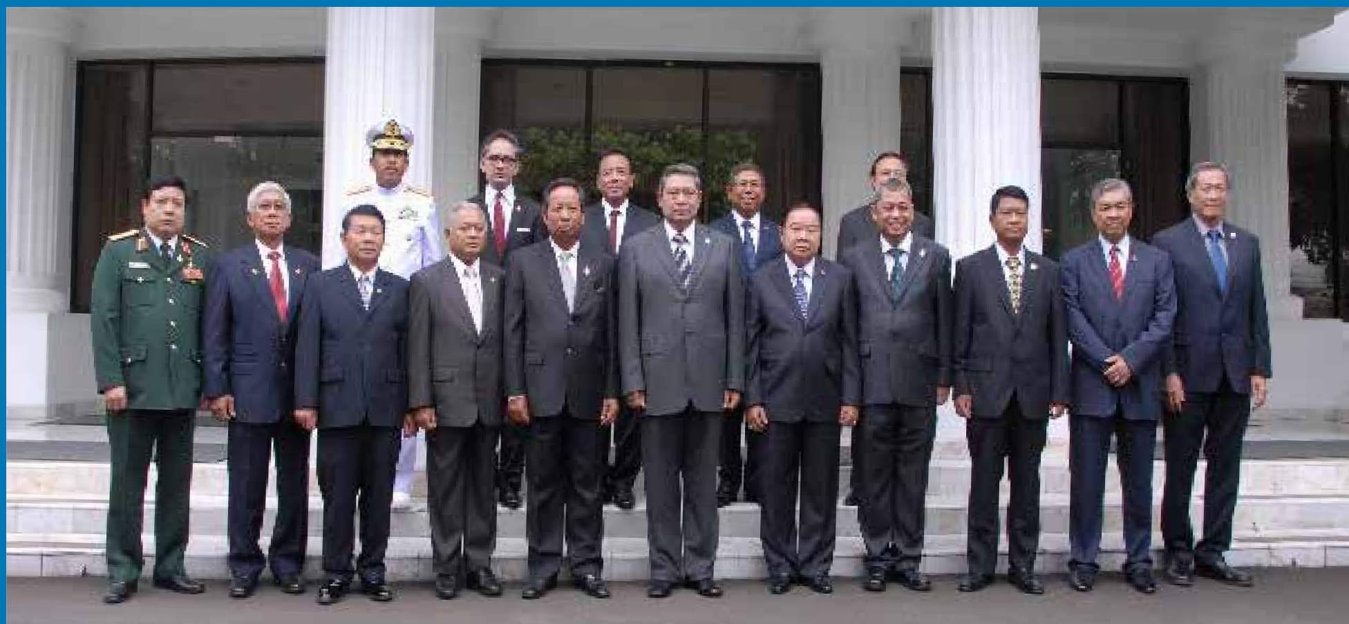
At the sidelines of the 5th ADMM, the Ministers of Defence and representatives paid a courtesy call to His Excellency the President of the Republic of Indonesia, Susilo Bambang Yudhoyono at the Indonesian Presidential Palace.