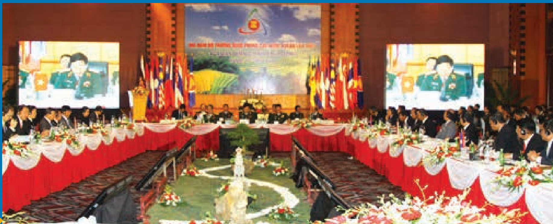
The 4th ADMM panorama