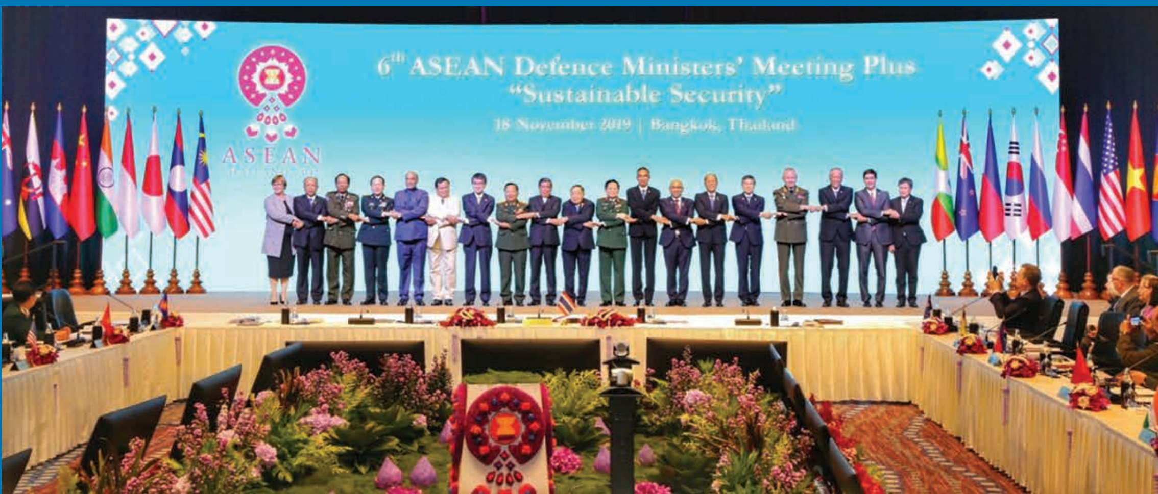
6th ADMM-Plus, Bangkok, Thailand, 18 November 2019.