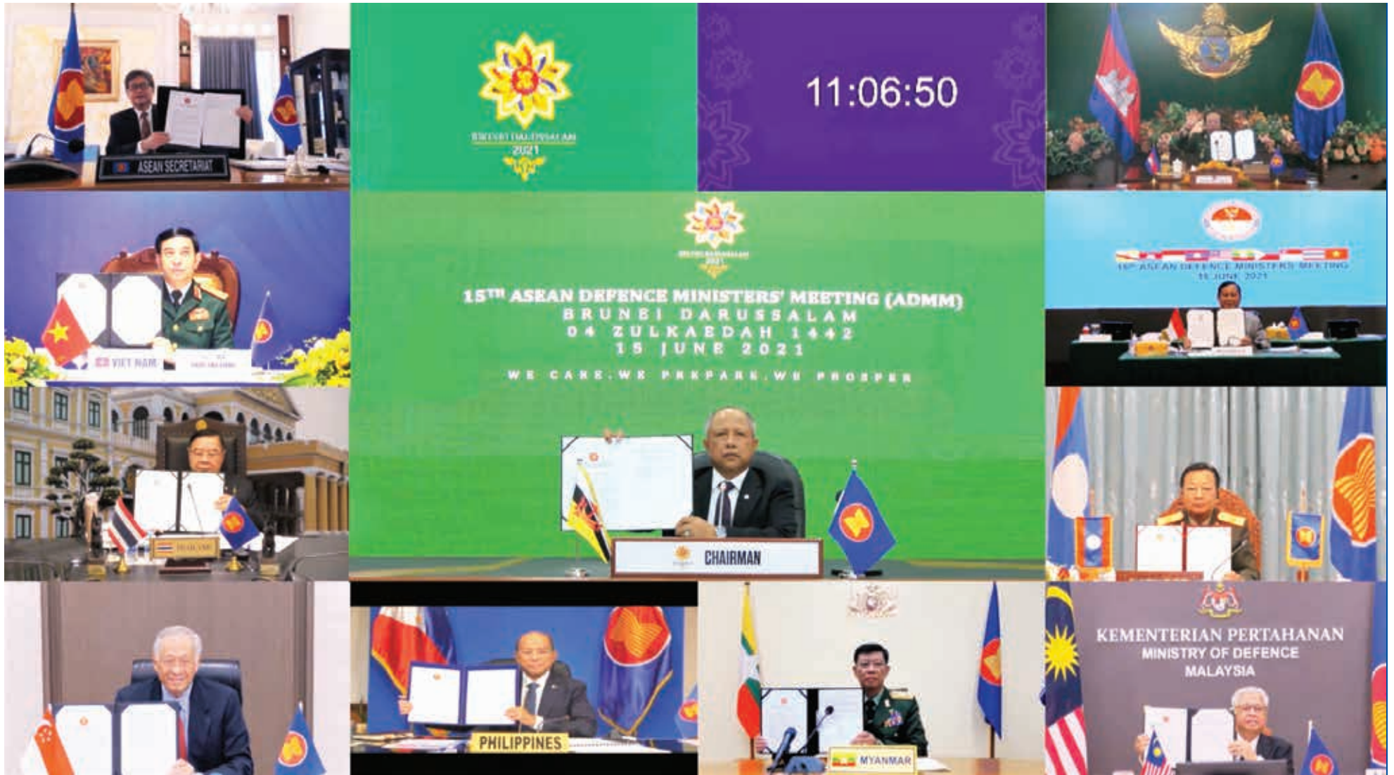
Adoption of the Bandar Seri Begawan Declaration in Commemoration of the 15th Anniversary of the ADMM Towards A Future-Ready, Peaceful and Prosperous ASEAN by the 15th ADMM

Further to this, the 8th ADMM-Plus Meeting also agreed to issue the Bandar Seri Begawan Declaration by the ADMM-Plus in Commemoration of the 15th Anniversary of the ADMM on Promoting a Future-Ready, Peaceful and Prosperous ASEAN, lays out the commitment of the ADMM-Plus as one of the main defence platforms in support of AMS' capacity and preparedness to address current and emerging challenges.